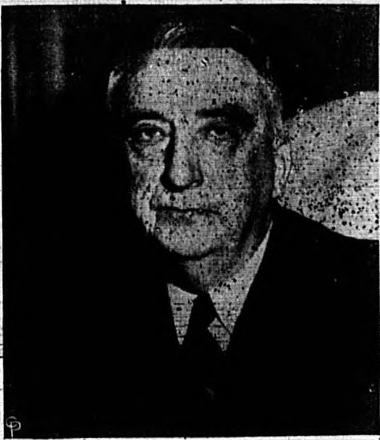
ATTIRED IN HIS official robes, the first time as a new term Chief Justice Fred M. Vinson appears in the bench of the Supreme Court in Washington, for the first time as a new term Chief Justice of the high court.