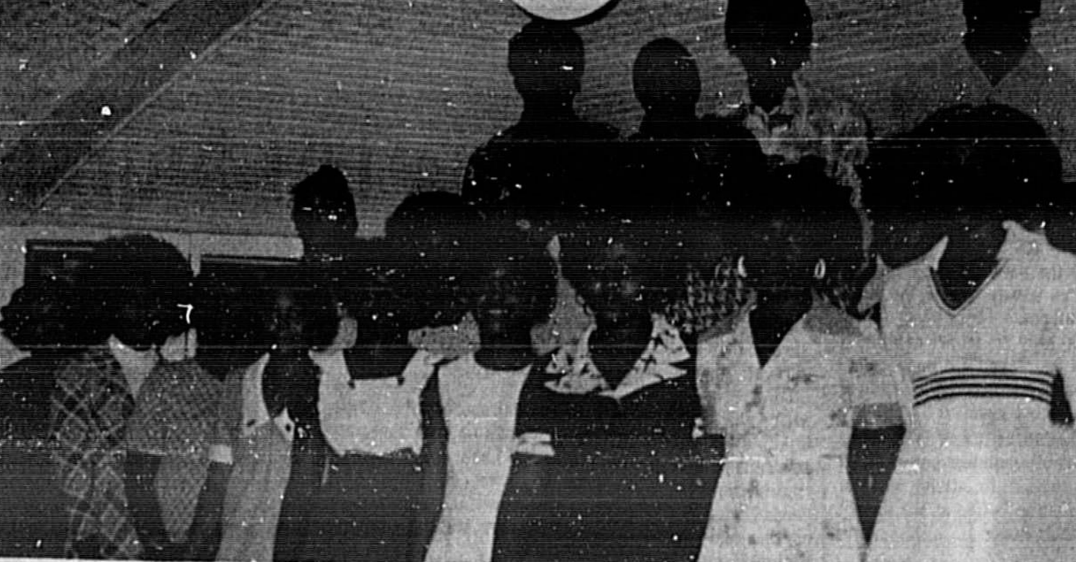
The Young Christians Singers will observe their second anniversary on Mother's Day Sunday at 2 p.m. at St. John Missionary Baptist Church...