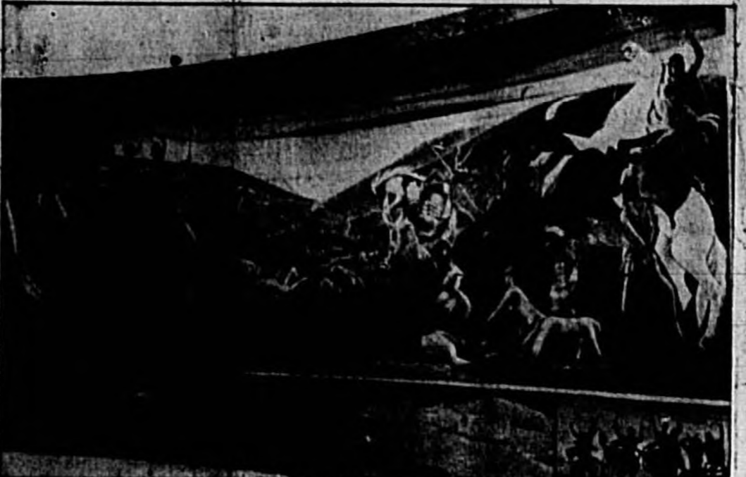
More about females than the "Dangers of the Mail" as it is titled, this mural in Washington's Post Office building has attracted wide criticism. Basis of the mural is a tale of a New Mexico governor's daughter and friends being captured by Indians while herding sheep unclad.