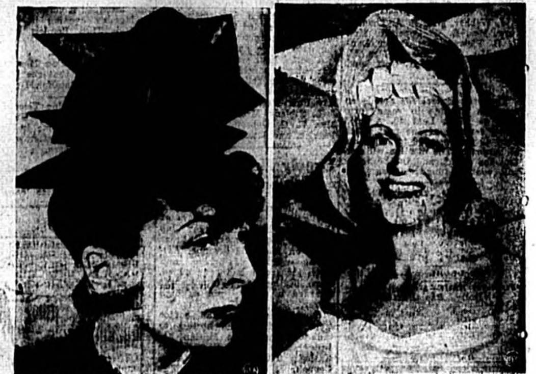
IN SPITE of all the talk about the return to sanity in hats, look what's happened. Consider, for example, the weds at left. You think it's a geometric problem or the result of a child's effort to build something with his blocks, don't you? Not at all. It's a hat. And it's made of luckram. Notice the elaborate ear clip shown with it. At right is a little something alleged to have been inspired by the bonnets Marie Antoinette wore. Anyway, it's layers of pink and blue tulle with false curls of pink tulle across the forehead.