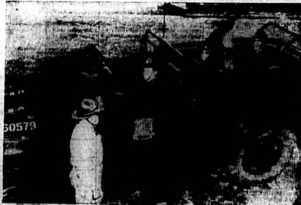
IN FRONT of their barracks at New Orleans stand these Louisiana national guardsmen, ready for any election trouble as voters went to the polls to nominate a governor. The militiamen are shown lined up for inspection. Come to think of it, some of the boys appear a mite chilly, too.