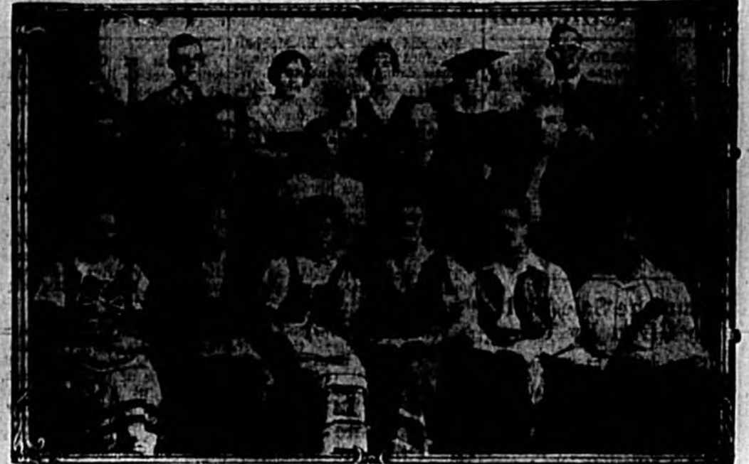
THE STUDENTS LEAGUE of Many Nations will give a program of vocal and instrumental music and several talks at the First Baptist Church Thursday evening at 7:30. There are 18 of these students, who, accompanied by their teacher are touring the state. They are of different nationalities and dress in their native costumes while giving their program. It is said to be one of the finest religious programs given by young people anywhere. They are all students at the Bible Training School at Binghamton, N. Y. The public is cordially invited.