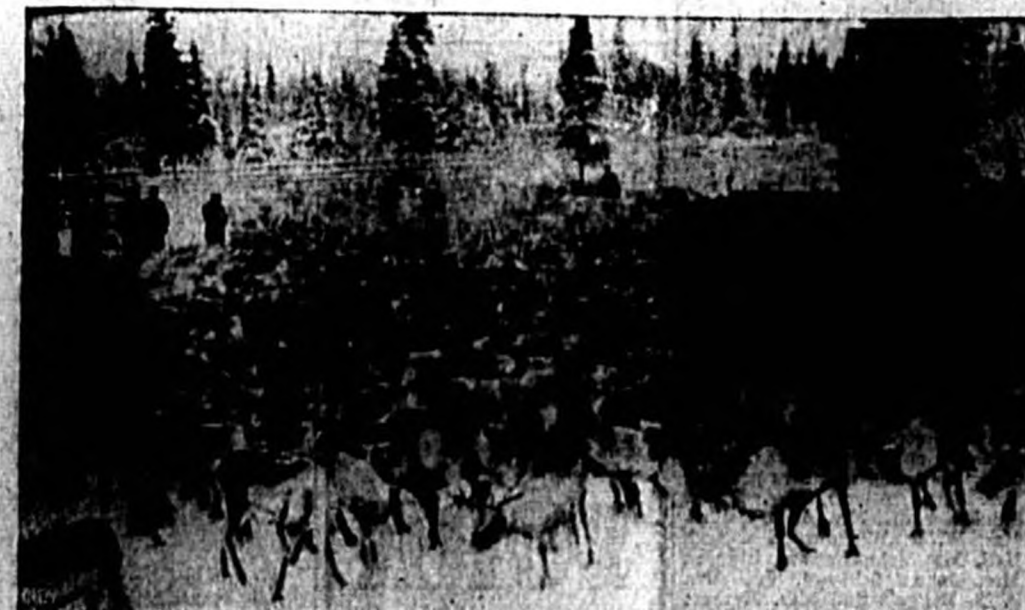
Refugee join women and children on the Finnish evacuation list as war moves dangerously close to Lapland feeding grounds. Valued for the transport, food and clothing they provide, thousands of these four-footed allies have been rounded up at Petkula for movement to regions safe from the Russians.