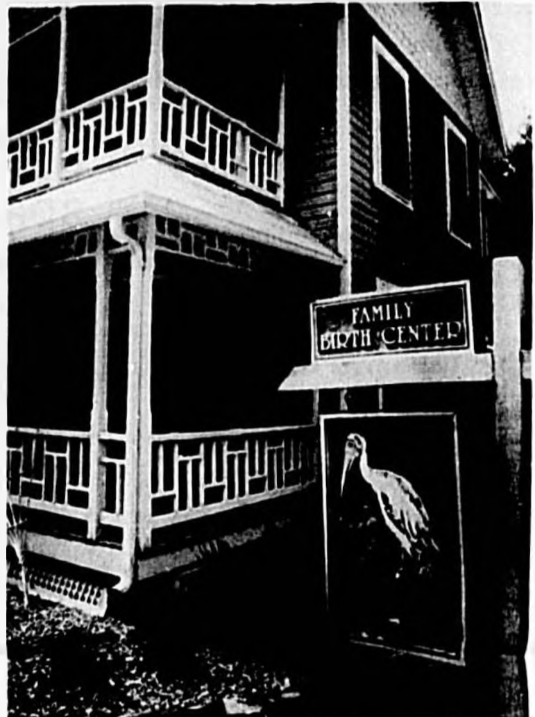
Family Birth Center in Longwood

Physicians Birthing Center, South Seminole Med-