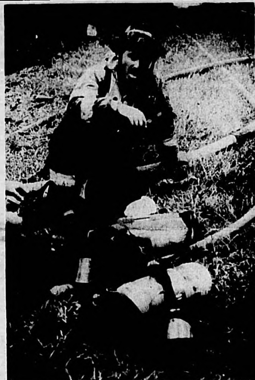
An exhausted firefighter rests at scene of Longwood fire.