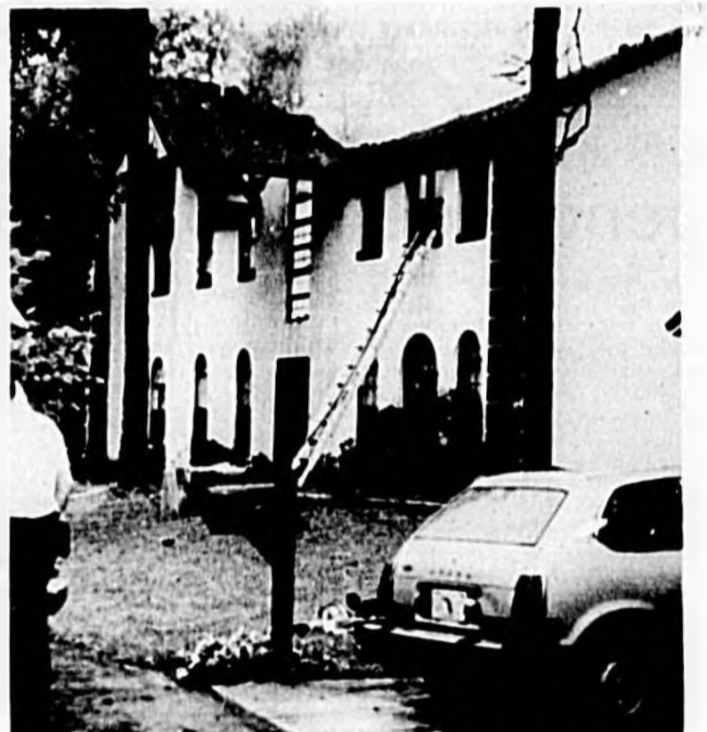
Longwood house destroyed, official said.