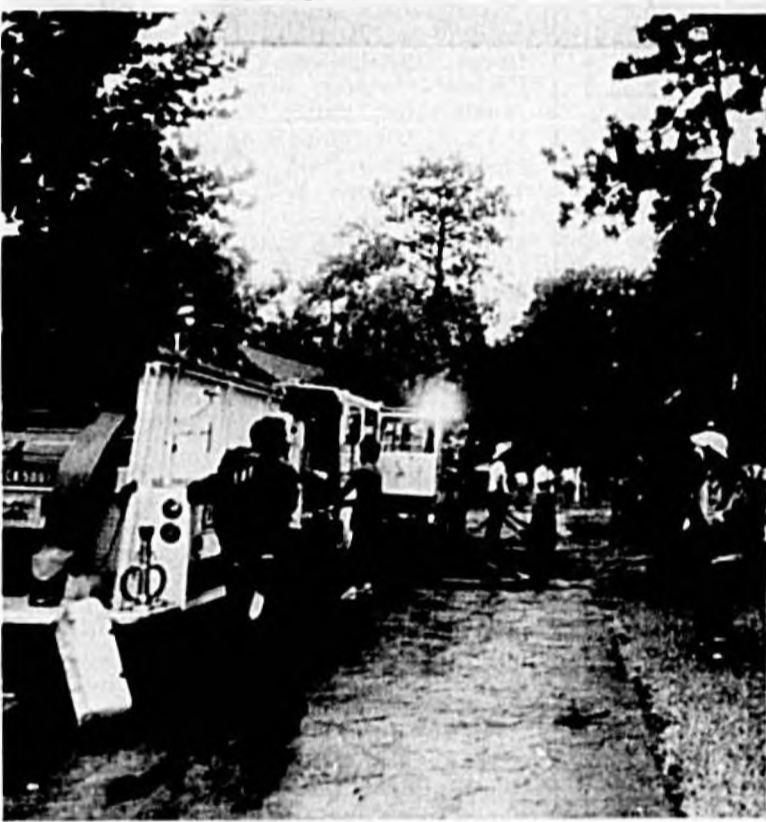
The scene at yesterday's fire.