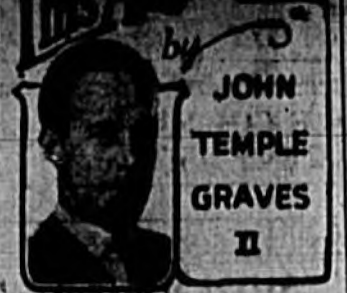
JOHN TEMPLE GRAVES II