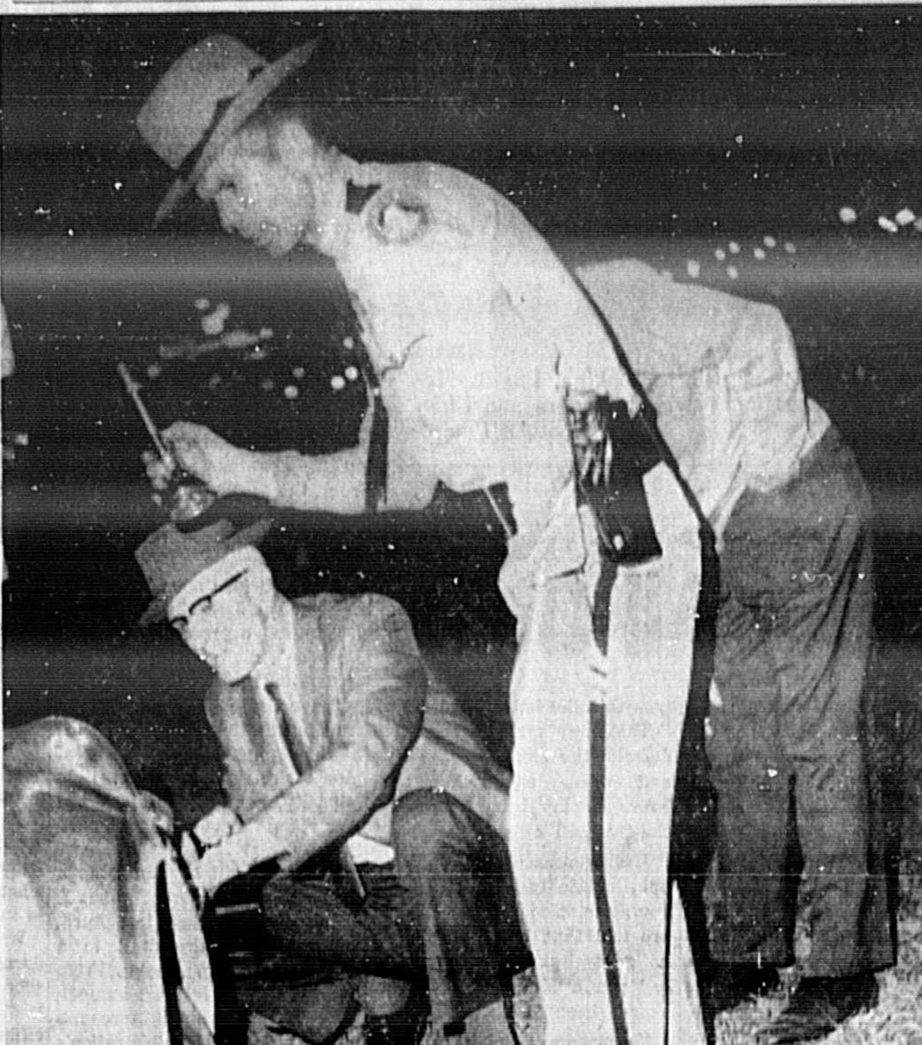
ANOTHER LOCAL HIGHWAY TRAGEDY

Many times in the history of the Fourth Estate a news report, which has erred in its factual detail, has inadvertently sparked public interest and public reaction which has much greater depth and much broader meaning than the single dispatch. This is precisely what has happened since this newspaper printed the "rights-of-way" which the city and Seminole County, in their respective land areas, control along the bulkhead of Lake Monroe. In The Herald initial report the area was described as being on city-owned land, although the discussion had dealt primarily with county-owned land and had been put on the agenda with the purpose of getting the city to agree to probable county action in that matter. (Continued on Page 4A, Col. 1)