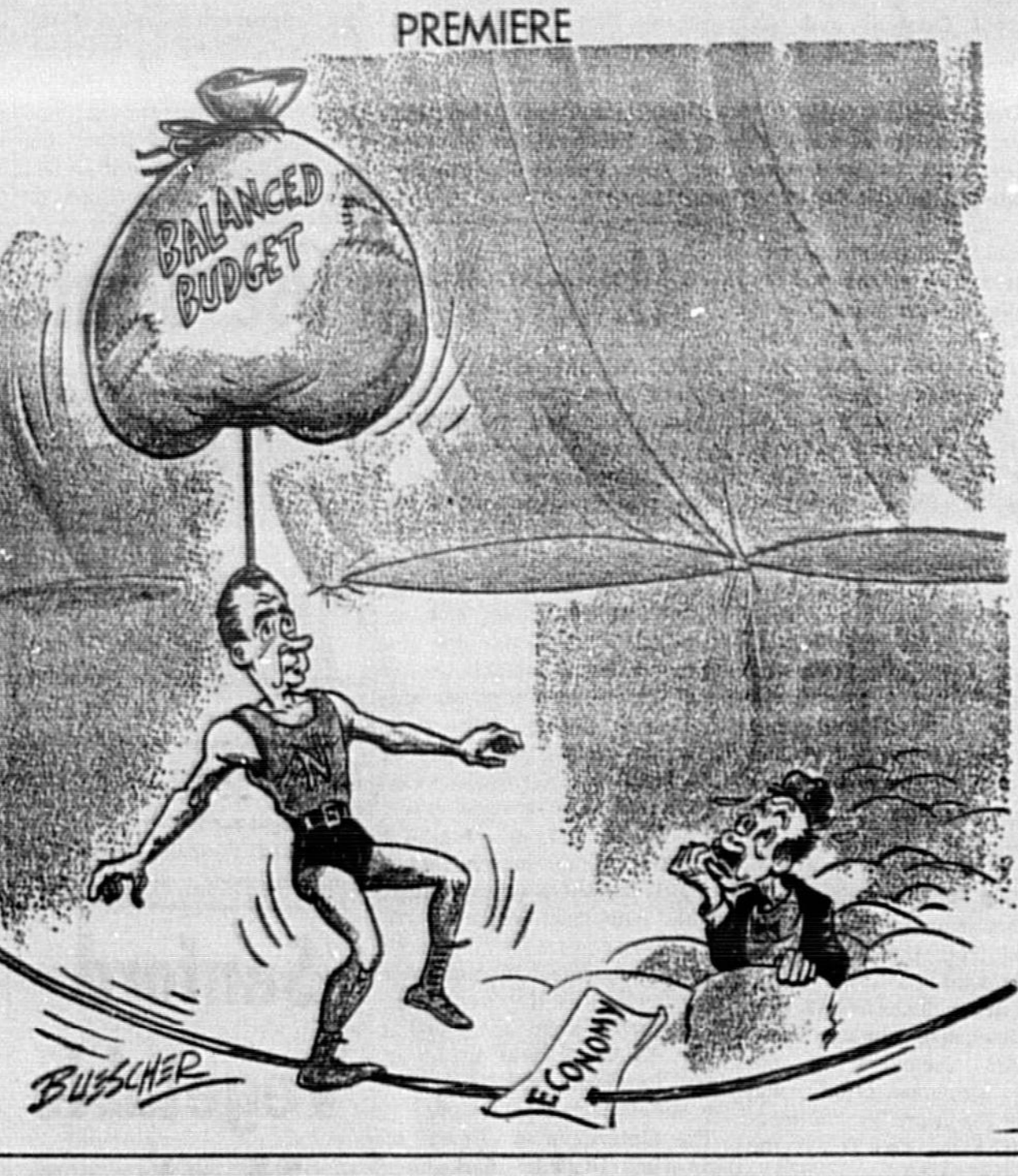
Crane's Worry Lines:

In a single 20-hour period, from August 24 to 25, in 1888, the raging inferno destroyed more than 12 billion board feet of prime timber. In a single holocaust, to use the words of the author, "The fire blew up! It blew 40,000 feet straight up!" Timber destroyed represented the production of all the lumber, shingle, lath and pulpwood mills in the United States for a full year in the early 1930's.