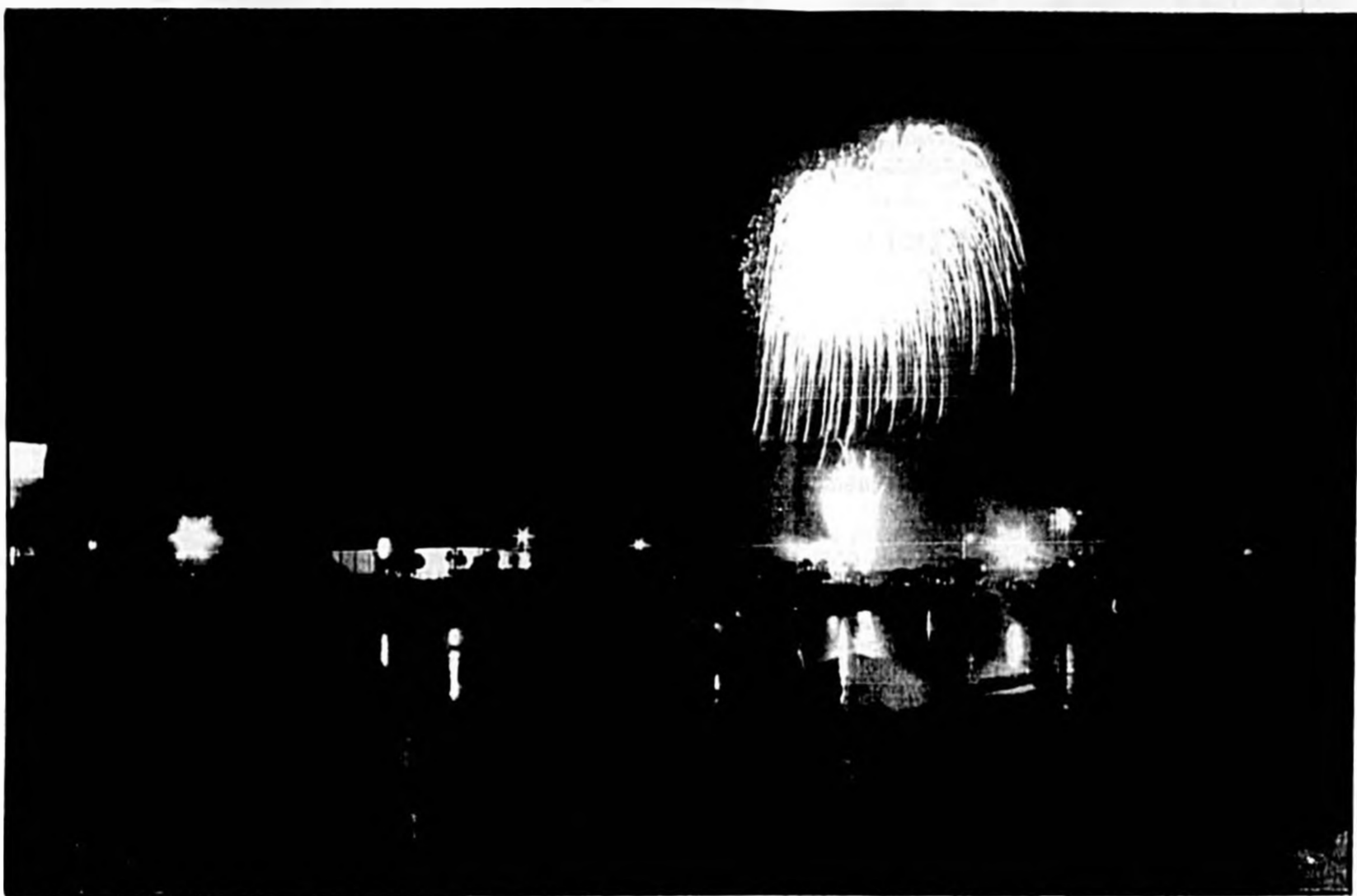
Last year's celebration along Sanford's Lake Monroe promises to be even better this year.