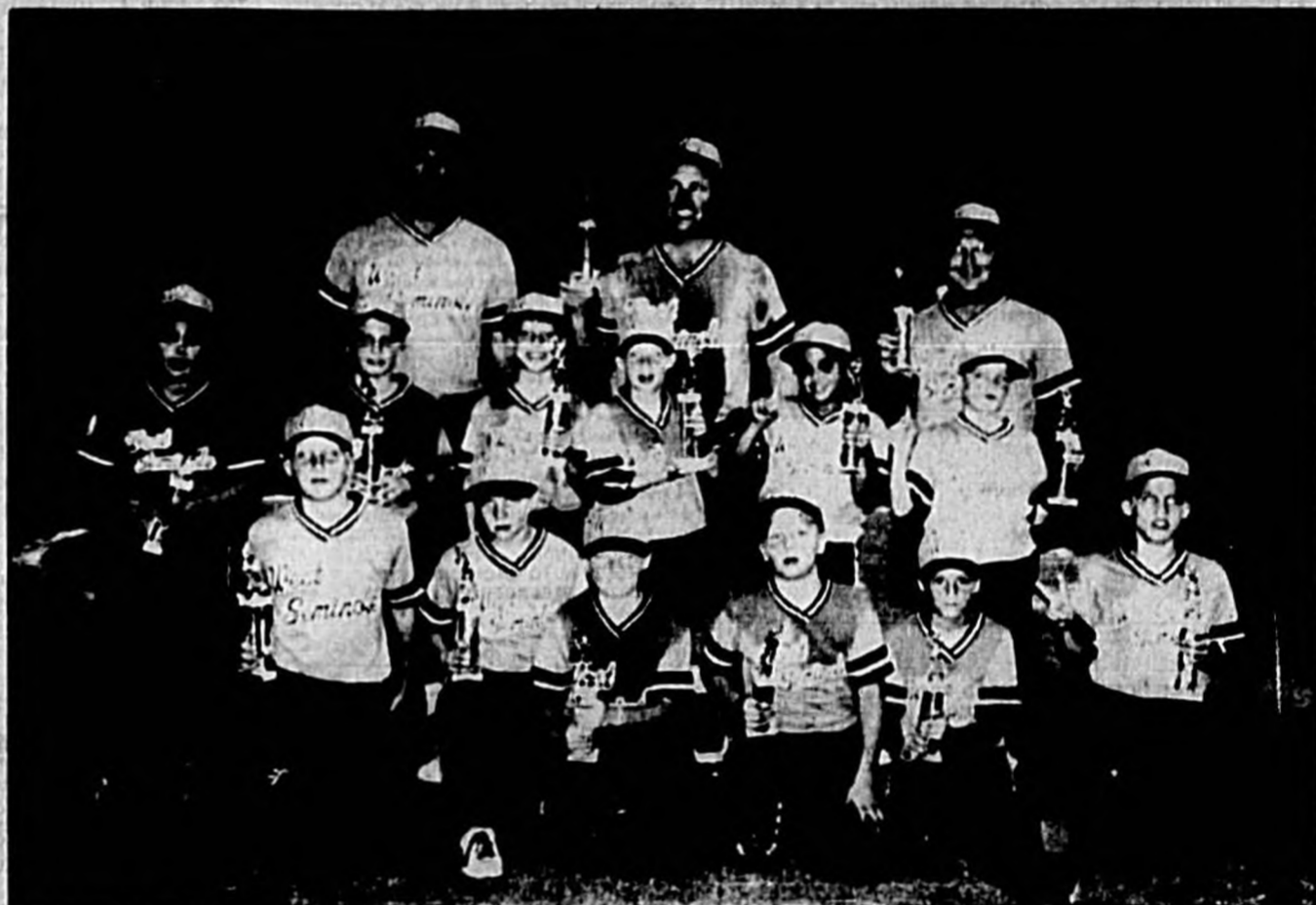
The West Seminole PONY Pinto Team All-Stars, better known as the Godzillas, pose with their trophies after winning the District Championship recently. The team is in preparations for the State Tournament that begins July 10 in Tampa.