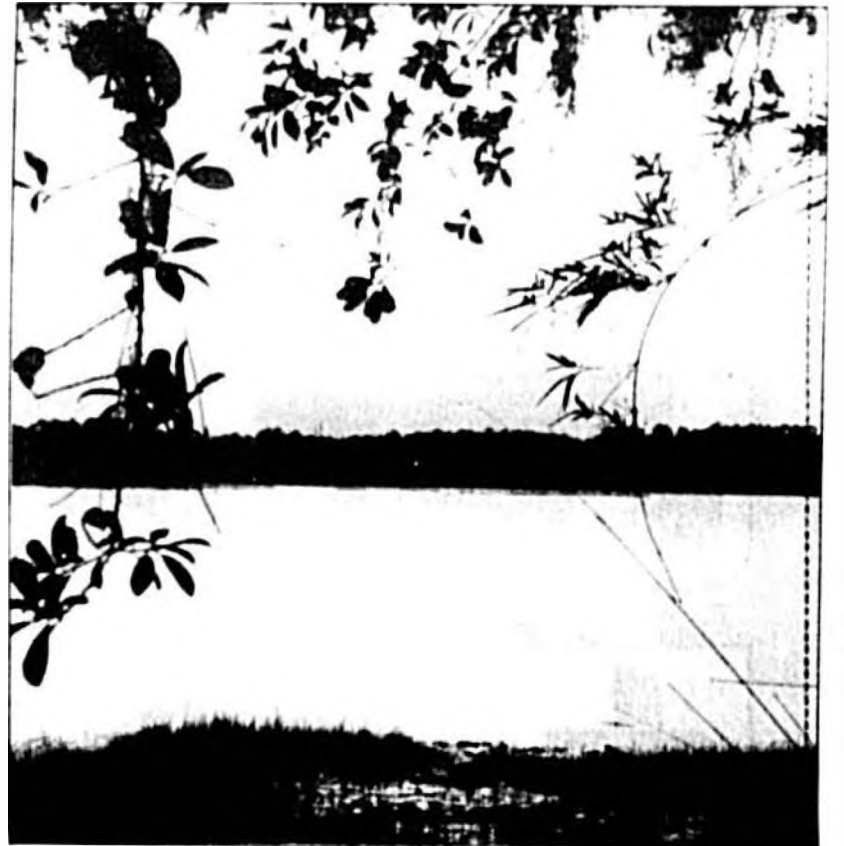
West Crystal Lake in Lake Mary, at one time the site of the Easter sunrise service.