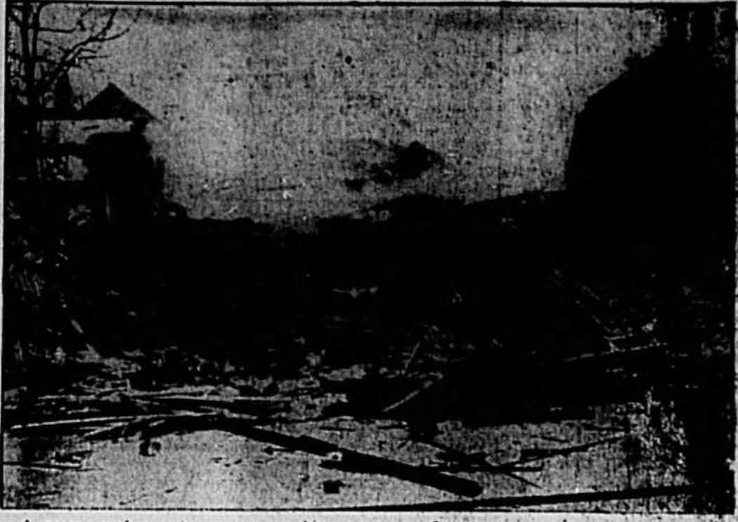
A garage employe and a customer parking a car were killed, three persons were injured and the entire town of Bath, Maine, was shaken by a gasoline fumes explosion that wrecked the garage, a two-story brick building. The smoking ruins are shown just after the blast.