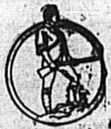
Mirute Man Six

$874.74 CASH AND Balance on Easy Monthly In- stallments