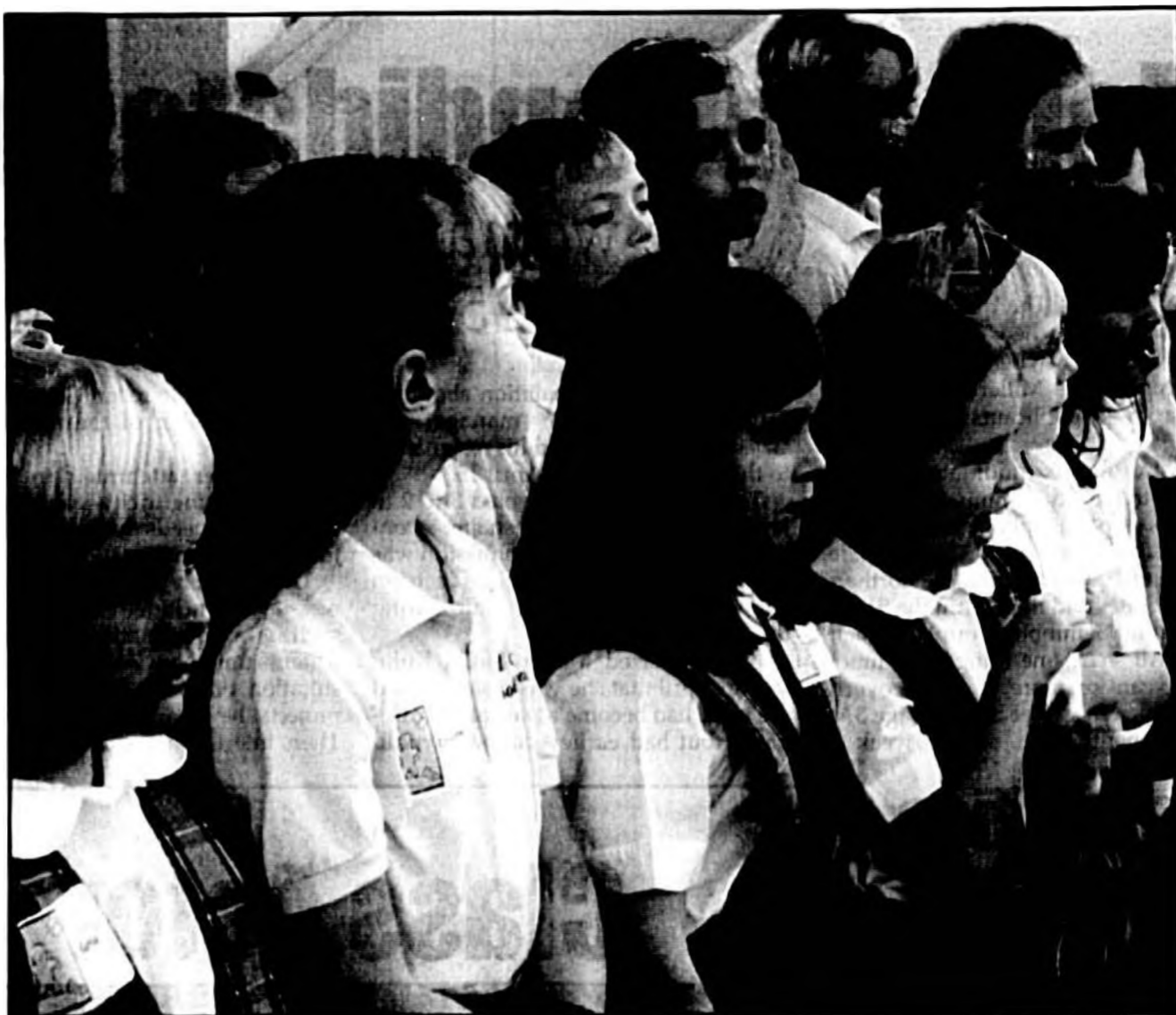
Ready and willing to absorb all that their teachers have to offer are these young students at All Souls Catholic School in Sanford. Catholic schools in the Diocese of Orlando normally start a few days after the public institutions. These students are excited about the new school year as classes began Aug. 4.