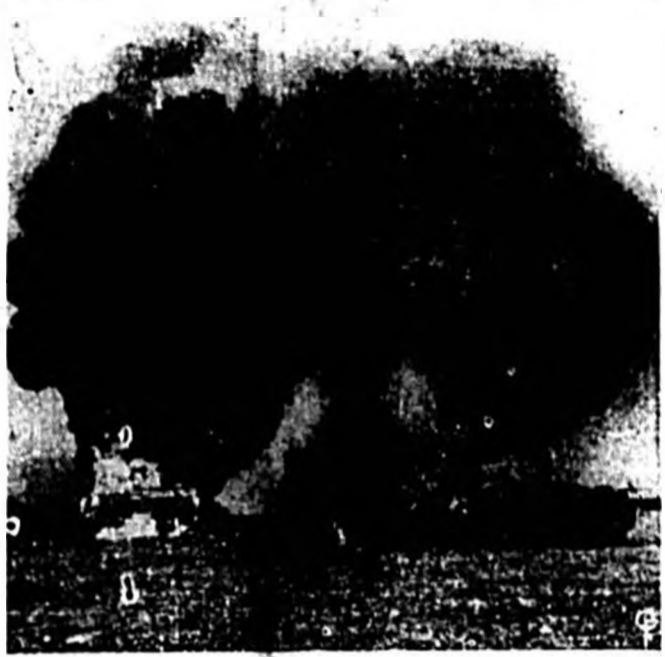
Axis tanks and supply trucks are pictured ablaze following the strong British offensive in Cyrenaica. South African troops helped blow up these German and Italian armored vehicles and supply trucks. The mopping up of Axis forces behind the lines is still going on according to the latest reports. This photo was passed by the British censors.