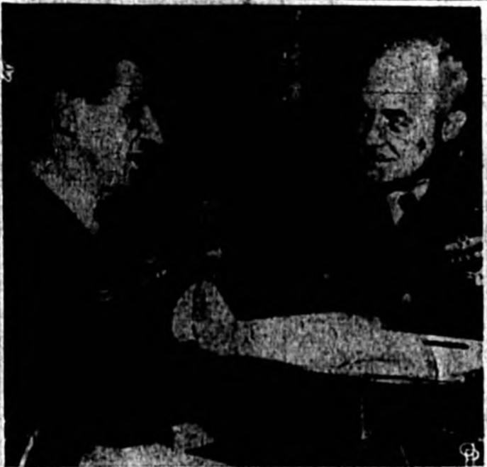
Air Chief Marshal Sir Charles Portal (left), the RAF boss, and Lieut. Gen. Henry H. Arnold, chief of the U. S. air forces, are shown in Washington discussing details of the grand Allied air strategy.