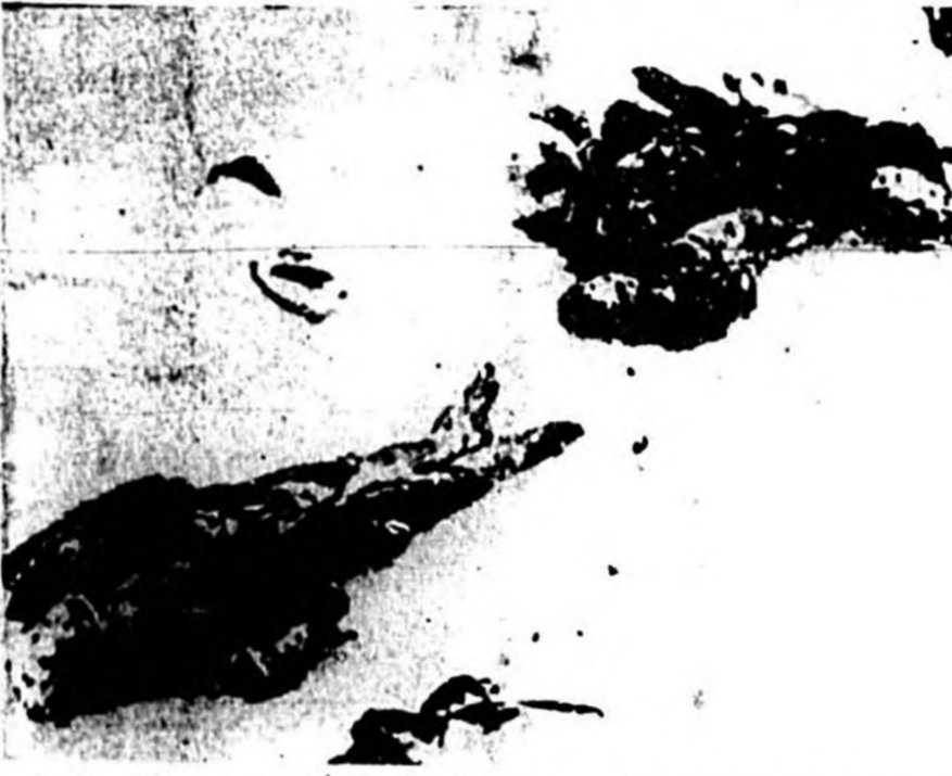
Frozen Germans on the Russian front, in a ditch near King, where the cold is so severe the description of this photo approved by both the Soviet and British censors. The corpses are an air down to face their guns.