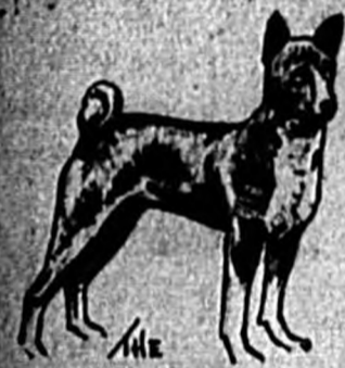
THE BASENGI DOG OF AFRICA CANNOT BARK