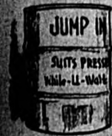
TAILORS SIGN MADISON WISCONSIN