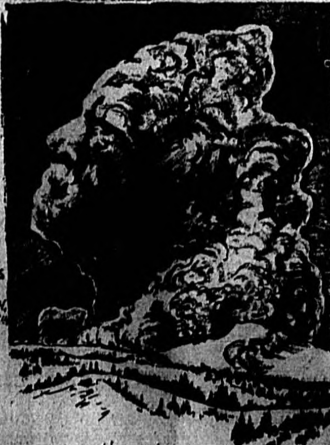
WHEN MOUNT LASSEN - ONLY LIVE VOLCANO IN THE U.S. - ERUPTED IN 1914 THE VAPOR CLOUD TOOK THE FORM OF VULCAN'S HEAD