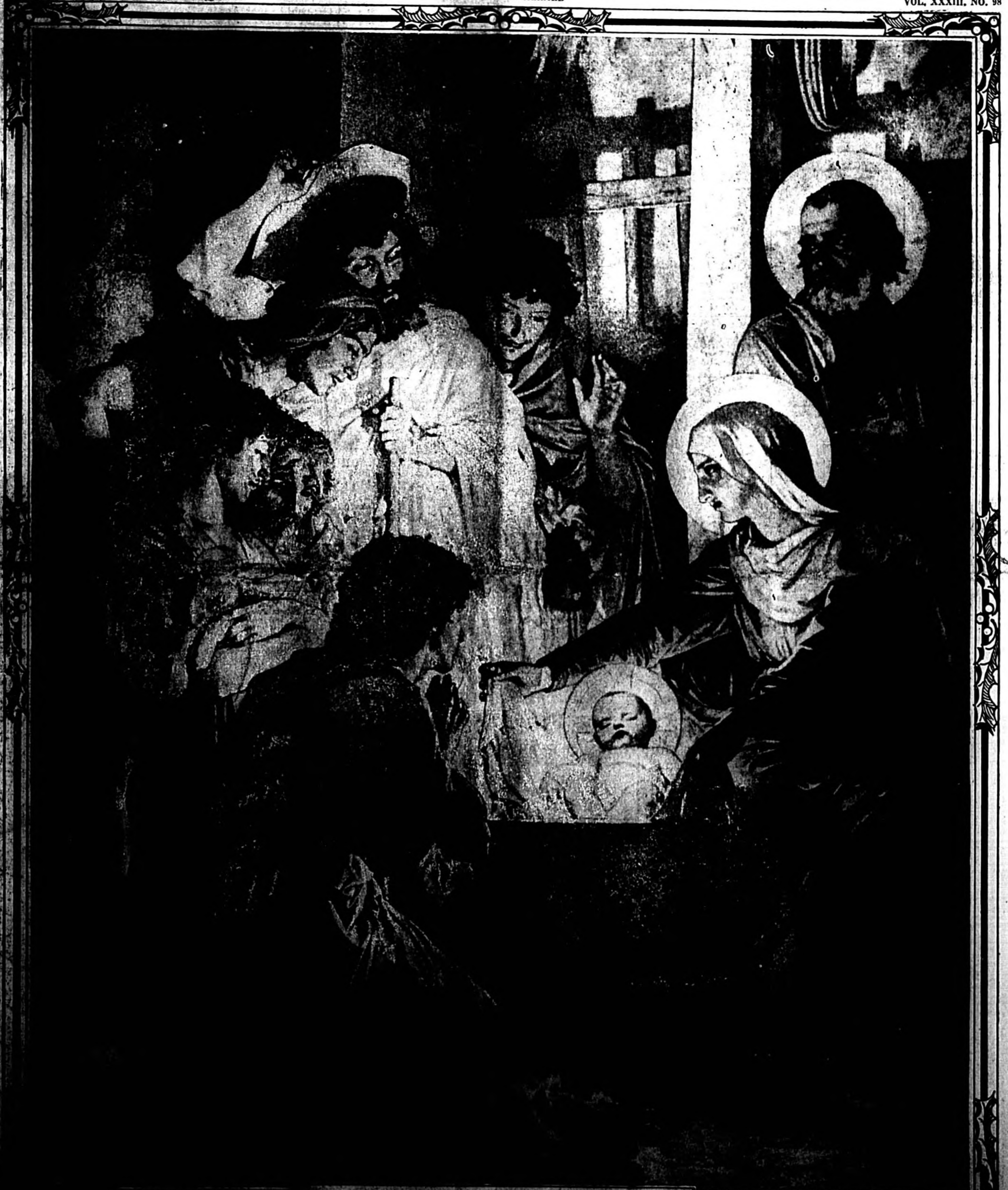
THE ADORATION of the SHEPHERDS