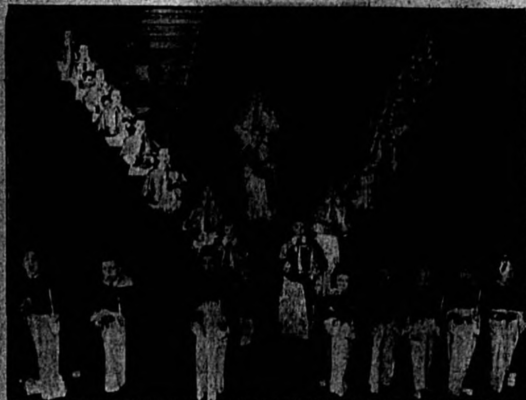
Stirkingly arranged as three dots and a dash in front of a V-for-Victory, choirboys rehearse hymns they will sing Christmas Eve at the Catholic Church of St. Catharine of Siena, in New York City. The chorists are all neighborhood youngsters, chanting their prayers for victory over the tyranny and oppression that has descended upon the world.