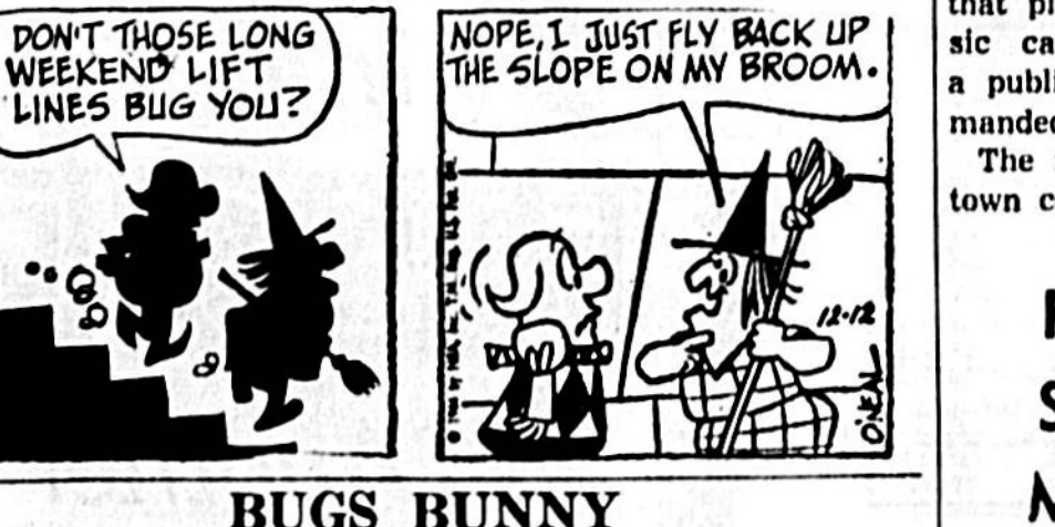
"I HEAR YOU WENT SKING OVER THE WEEKEND."