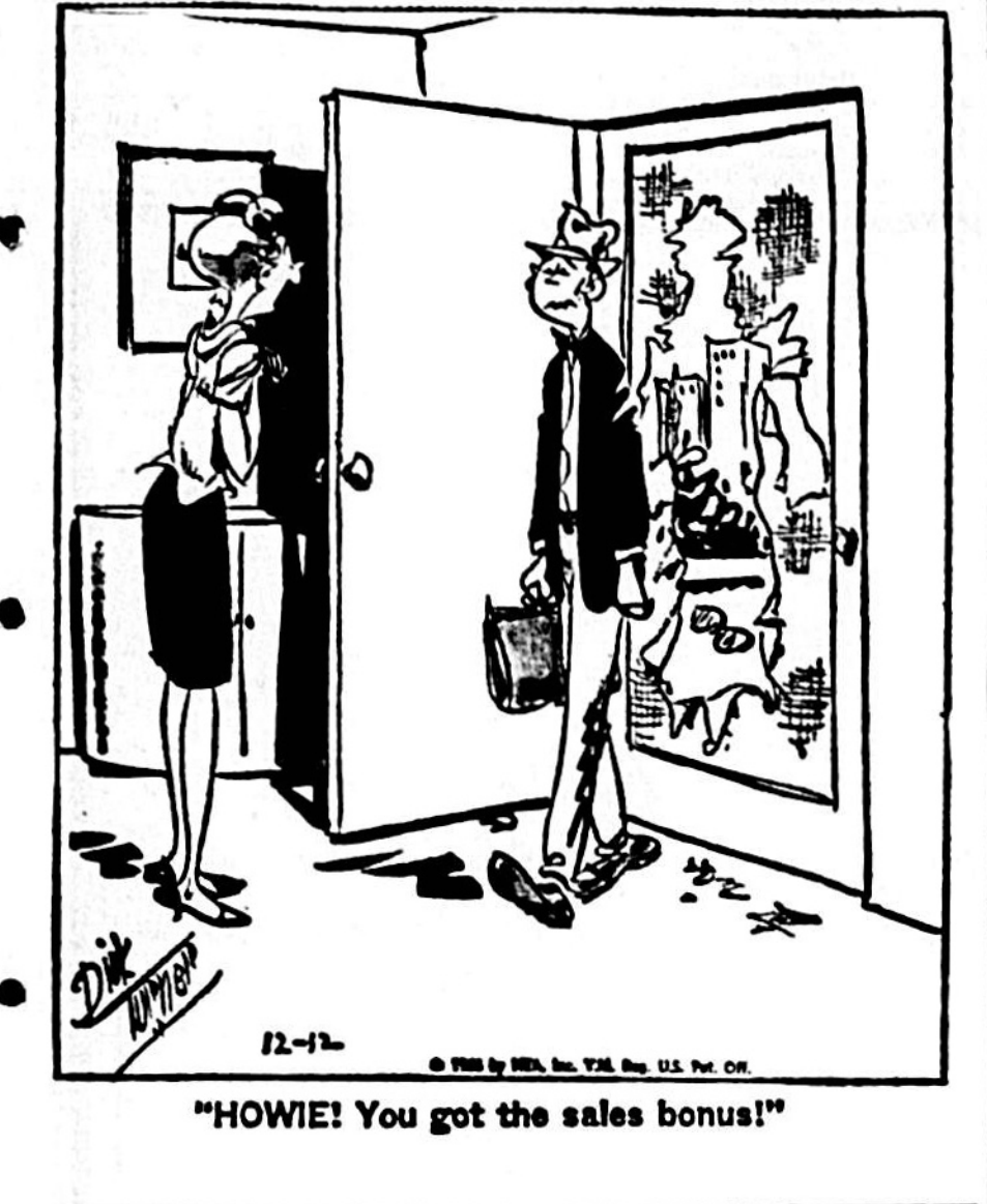
"HOWIE! You got the sales bonus!"