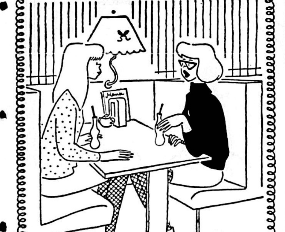
"My father had to go out of town and he took my allowance with him!"