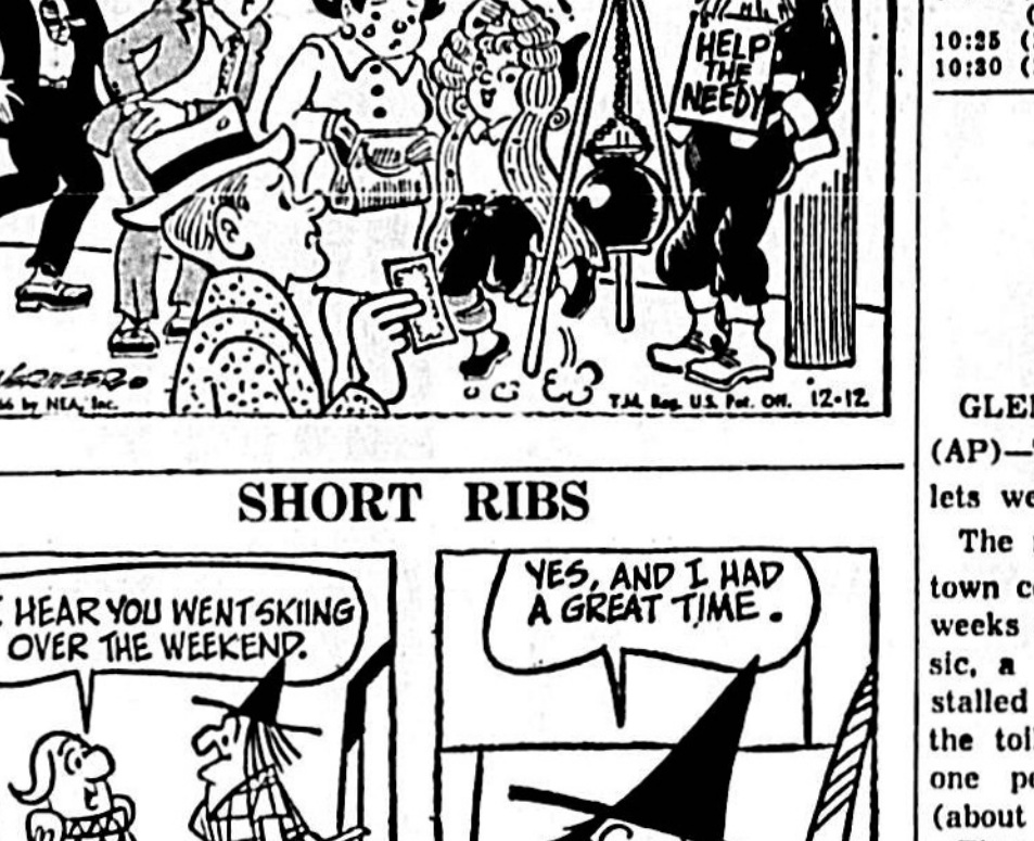
"WHERE ARE YOU SWEATER? GOT A JOB WORKING FOR SANTA!"