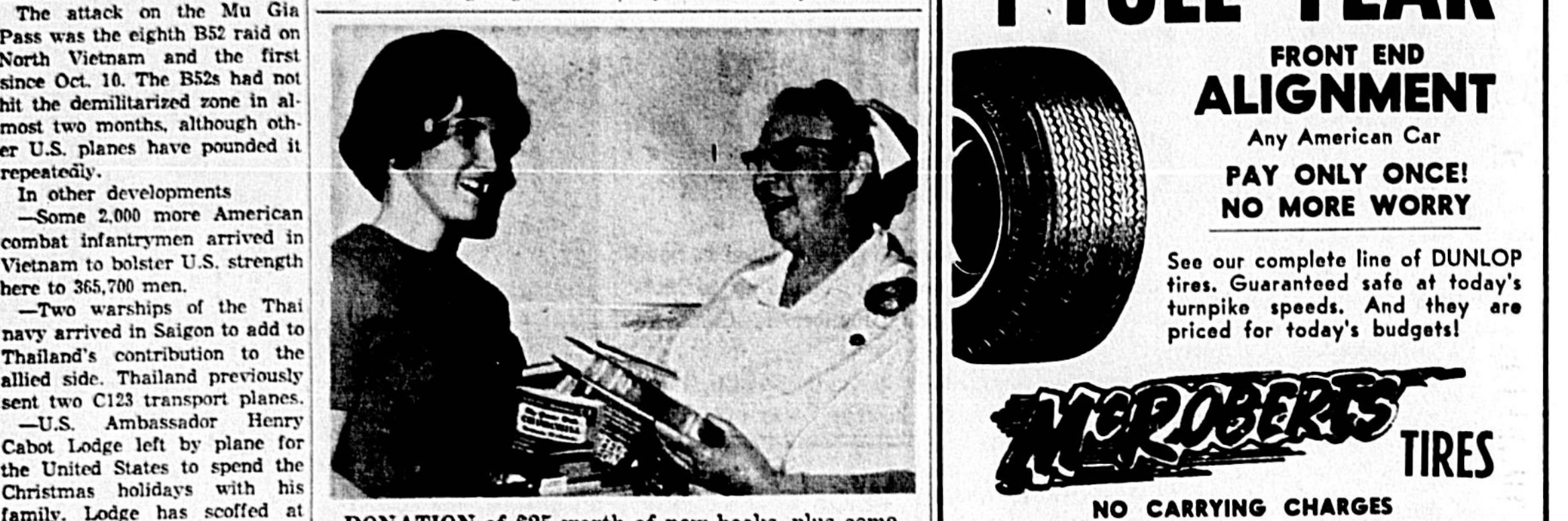
GUARANTEED IN WRITING 1 FULL YEAR FRONT END ALIGNMENT Any American Car PAY ONLY ONCE! NO MORE WORRY

SAIGON, South Vietnam (AP) — Striking at Communist forces believed readying another drive south, U.S. B52 Stratofortresses bombed the Mu Gia Pass in North Vietnam today and the demilitarized zone between North and South Vietnam Sunday.