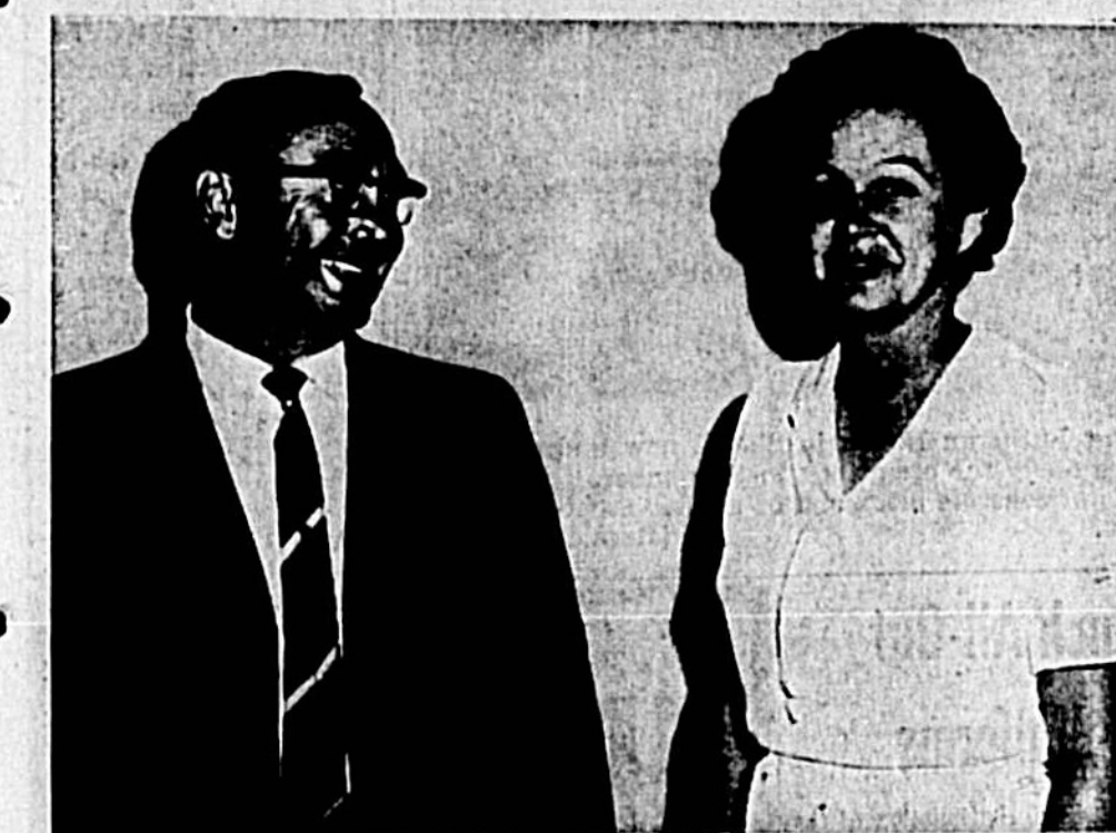
TWO VERY IMPORTANT PEOPLE, who last night became part of Sanford's future...