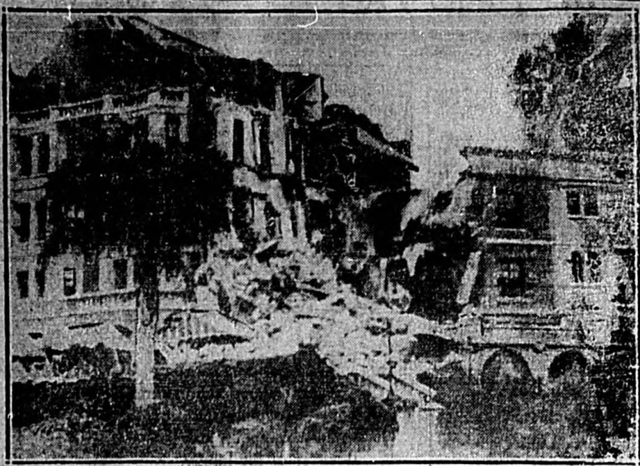
Several persons sleeping in the Arlington Hotel at Santa Barbara were killed when the earthquake tore a great gap in the structure and sent rooms on the third floor crashing to the street below. The ruins of the hotel are strikingly shown in the photograph above. The wreckage, under which the victims were buried, is piled in the street.