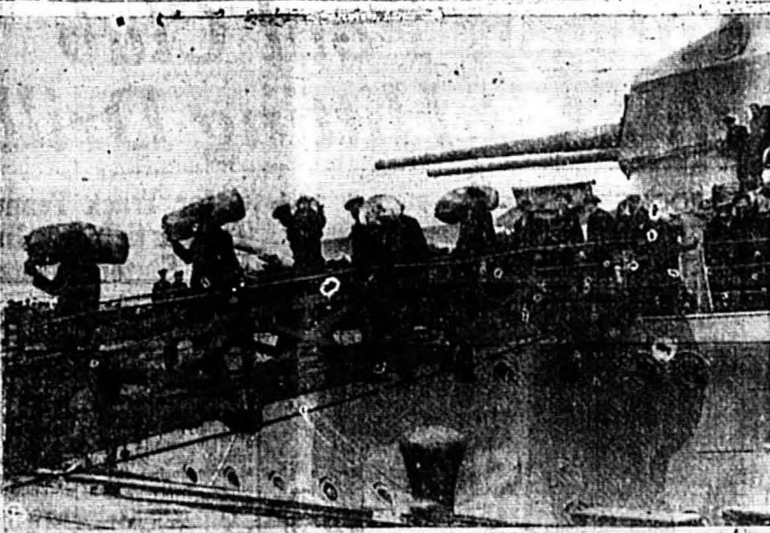
CREW MEMBERS OF THE NAZI CRUISER Prinz Eugen are shown as they fled down the gangplank of the ship at the naval base in Philadelphia, Pa. In a surprising display of affection for members of the German Navy, some 3,000 German-Americans paid homage to the 547-man crew of the cruiser and showered them with gifts. The ship will be used as a "guinea pig" in the atomic bomb test at Bikini Atoll.