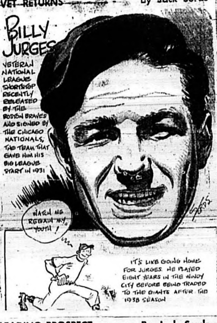
BILLY JURGES NATIONAL LEAGUE SHORTSTOP CHICAGO CUBS