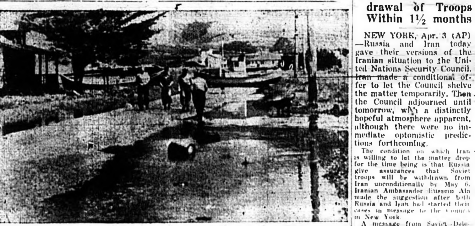
WASHED UP on the beach 100 yards and deposited across the road at Pointon-by-the-Sea, about 30 miles from San Francisco, these fishing craft show the power of the tidal wave that struck the Pacific coast after causing severe damage to property and lives in Hawaii. At least 25 persons in the Pacific Islands were killed, while 11 lost their lives along the California coast.