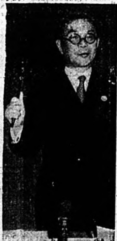
DEEPLY aware of the significance of the moment, Dr. Quo Tai-chi of China is shown as he prepared to start the continuous session of the United Nations Security Council at UNO headquarters in the Bronx, N. Y. A single tap of the gavel called the meeting of the delegates to order.