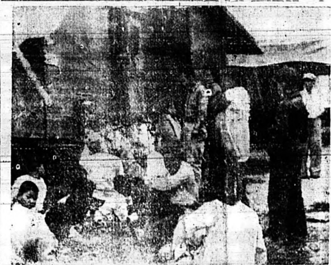
EVACUATED FROM THEIR HOMES when the gigantic tidal wave hit the windward side of Oahu, on which Honolulu is located, refugees sit in small groups awaiting assignment to temporary billets established by the U. S. Army. The tidal wave, created by an earthquake in the Dutch Harbor, Alaska, area caused unestimated damage and some 300 are either dead or missing on Oahu.