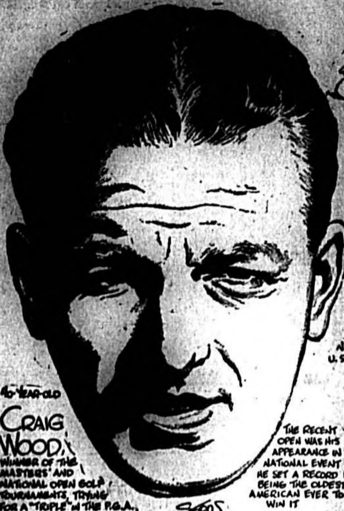
40-YEAR-OLD CRAIG WOOD, MEMBER OF THE AMERICAN OPEN GOLF TOURNAMENT, TRIPLE FOR A TRIPLE IN THE P.G.A.