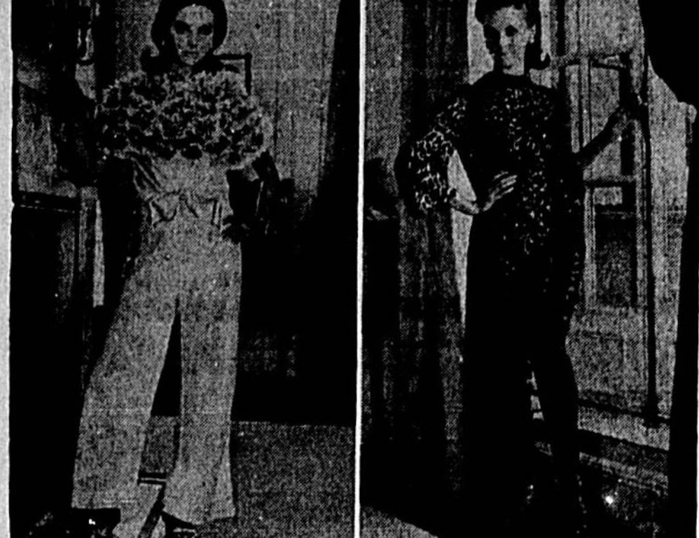
AT HOME FOR THE HOLIDAYS — For evenings at home during the holidays you can choose the pretty look of the iron look. Most feminine of pajamas (left) are in delicate but durable satin of nylon dacron and silk. Softly draped overblouse is ringed with a separate edge of petals. Eased pants end in bell bottoms. This is by Ruth Flaum. Turquoise, leopard-printed "seat suit" (right) by Vanity Fair is in stretch tricot made with Lycra spandex. Matching nylon top serves as a pretty cover-up.