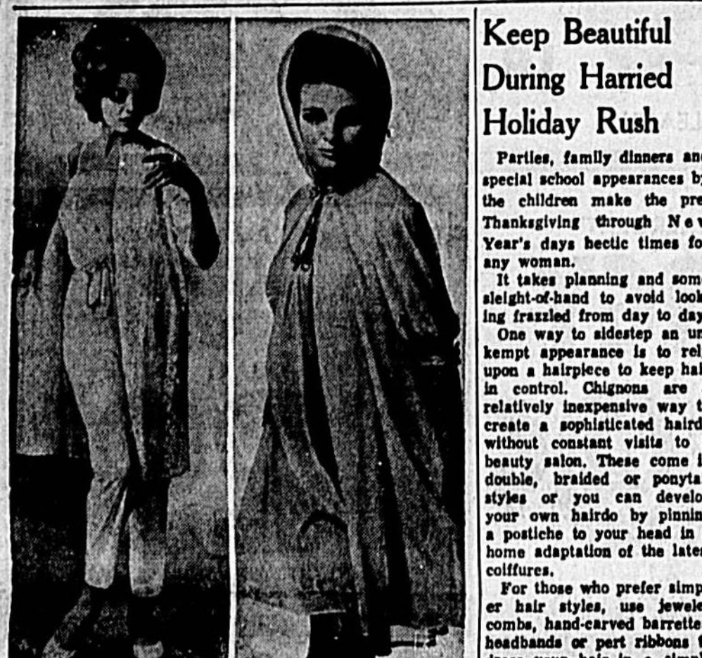
HANDSOME SLEEP and loungewear is a welcome gift at Christmas. Tapered trousers of pajama ensemble (left) by Henson Kieckhefer are topped by a blouse that is gently sashed at the waist. Co-ordinated coat is embellished with acanthus leaves. Sheer cover coat and hood (right) has the mystic look of the Far East when worn over a crepe, transparent gown. This is styled by Blanche Lingard. Easy crepe-nylon is used in these designs. The pebbling in this crepe tricot is built into the yarn and will not be removed by frequent washing.