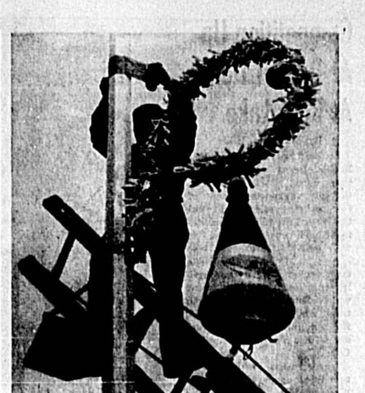
SIGNS OF THE TIMES: Up go the Christmas decorations for downtown Sanford, to usher in the gala holiday season. City crews began this week to affix the illuminated ornaments to lamp posts.

Seminole County . . . on the St. Johns River . . . "The Nile of America" The Sanford Herald Phone 222-3611 Zip Code 32771 WEATHER: Monday 69-54, 23 inch of rain; low tonight in 40s; rather cold Wednesday. VOL. 58 United Press Leased Wire Established 1908 TUESDAY, NOV. 30, 1965 SANFORD, FLORIDA NO. 72