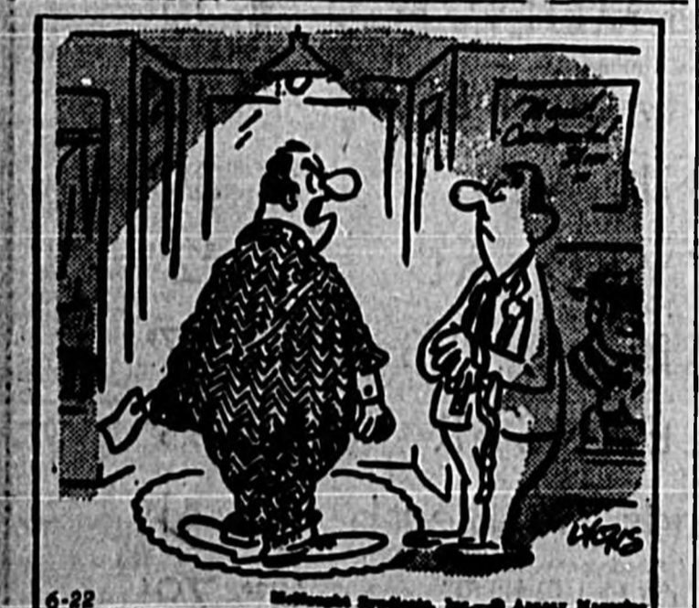
"I know it fits like a glove. Do you have one that fits like a suit?"