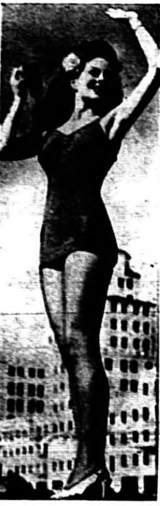
Introducing pretty Jeanne Crain, of Los Angeles, selected by the amateur cameramen of America as Miss Camera Queen of 1942 during the annual contest at Long Beach, Cal. We'll say she was snatched with just the right exposure.