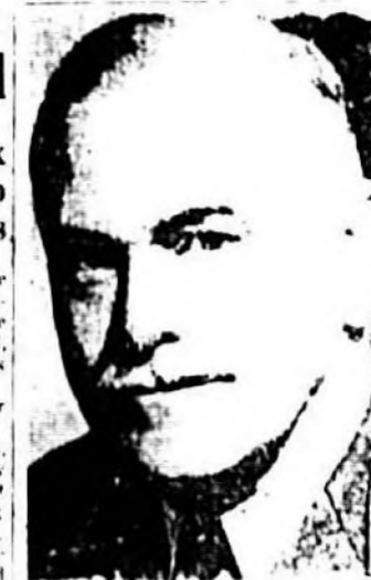
Gen. Sir Thomas Blamey, commander in chief of the Southwest Pacific Command of the United Nations, with headquarters in Australia, announced the selection of Gen. Sir Thomas Blamey as commander of the Australian Army in the Southwest Pacific.