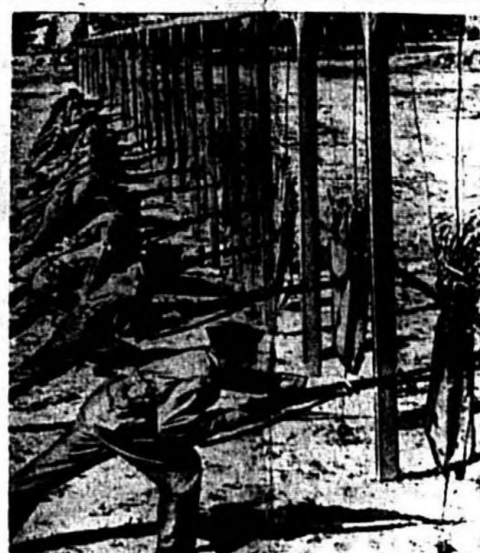
Members of the officers candidate school at Fort Benning are shown at day practice, and they couldn't be more enthusiastic if every dummy were an Axis soldier. The school is now graduating a thousand new officers each week.