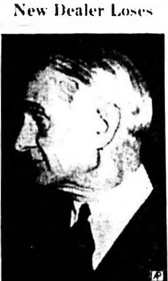
William Gibbs McAdoo, New Dealer and Democratic candidate for re-nomination of Roosevelt today won 530,000 votes in California, but lost to the Republican, Sherman Downey, by a margin of more than 30,000 votes.

Senator Smith Leads Gov. Johnston In South Carolina By Over 30,000 Votes McAdoo Trailing In California Downey Has 34,000 Vote Edge On President's Candidate