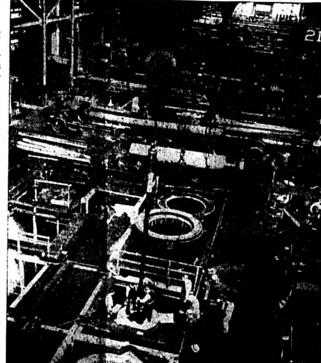
In birthplace of the big guns—the loudspeakers of U. S. "mortal war" are built and repaired. Some 5000 men are employed there, and above view gives an idea of the factory's size. Since "life" of big guns is limited by time they are fired, they must be returned to factory for retooling. Completed guns are greased inside and out as protection against weather conditions.