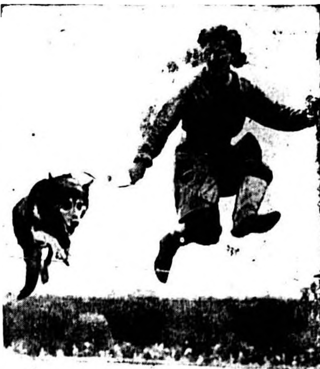
NOT LEAP YEAR, but kennel maid at Haslemere in Surrey, England, displays good form training an Alsatian.

By Charles W. Pierce. PALM BEACH, Aug. 29. —When I arrived in Lake Wales in the fall of 1937, there were very few coconut trees growing there.