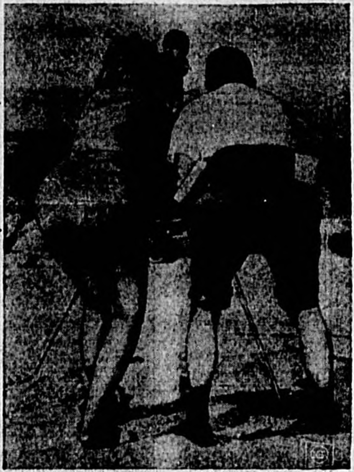
THERE GOES GRISSOM . . . A news cameraman at Cocoa Beach helps a pretty girl sight through the telescopic lens of his camera for a look at the second Mercury Capsule shot from nearby Cape Canaveral.

mother were "relieved it's over." He said "we wouldn't want to go through it again." Liftoff and the flight itself were flawless. Grissom, whose capsule had a larger viewing window than Shepard's reported at the beginning of his weightless period: "Boy, that sun is really bright! The sky is very, very black." At one point he said the view from his "picture window" was so "fascinating" he almost forgot to do his spacecraft maneuvering chores.