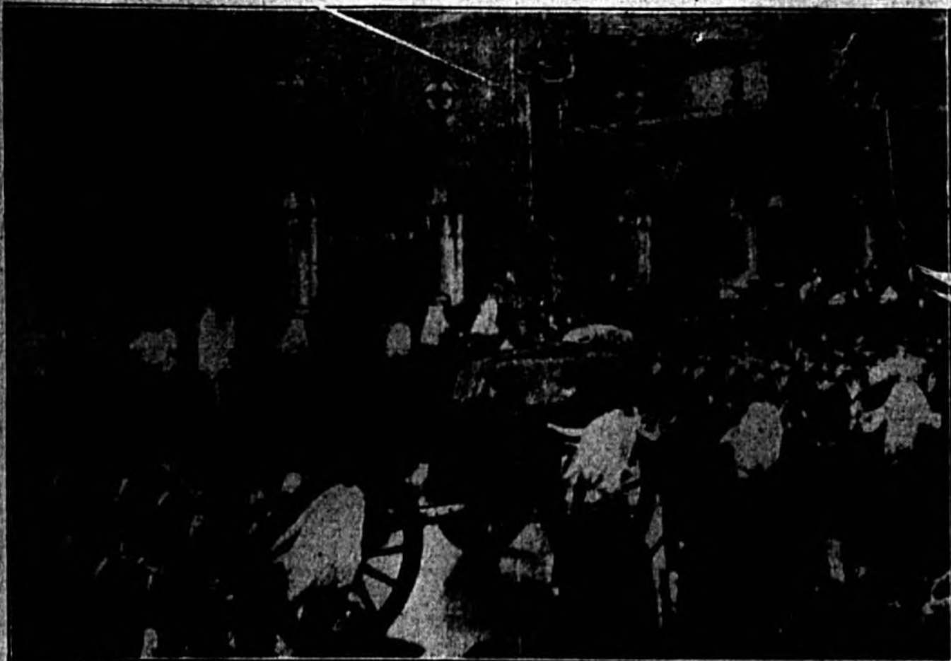
While thousands of mourning subjects lined the streets, the casket of King George V, mounted on a gun carriage, is shown in this radiograph as British sailors drew it from Westminster Hall to Paddington station en route to the tomb at Windsor. After a simple funeral service, the body was placed in the royal vault of St. George's chapel, the burial crypt of British monarchs.