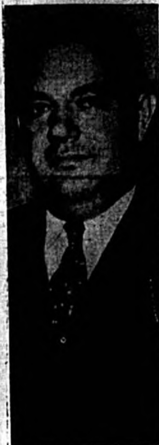
As lieutenant governor of Louisiana, James A. Hoo (above) automatically became chief executive following the unexpected death of Gov. O. K. Allen after a cerebral hemorrhage.