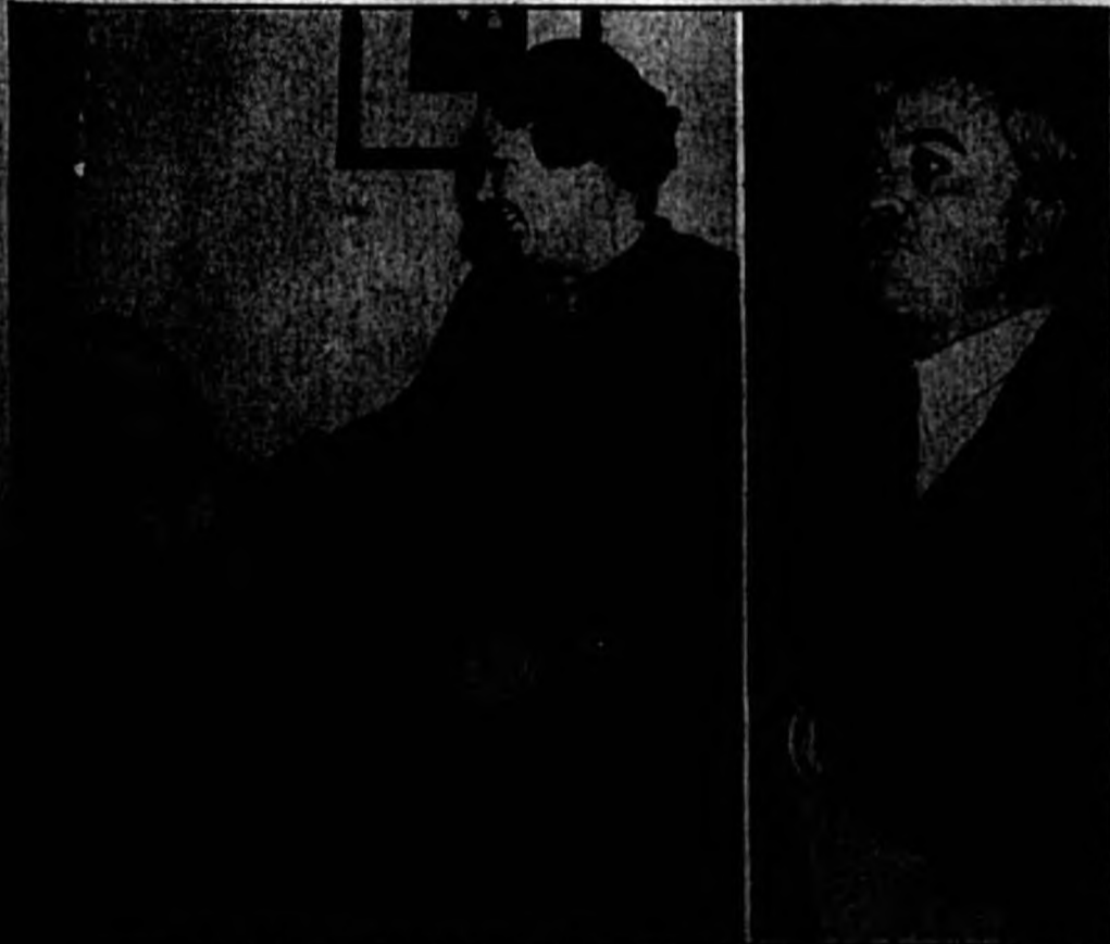
Gov. O. K. Allen died unexpectedly in the city of New Orleans after a long illness. The funeral at the city's largest church was held on Monday.