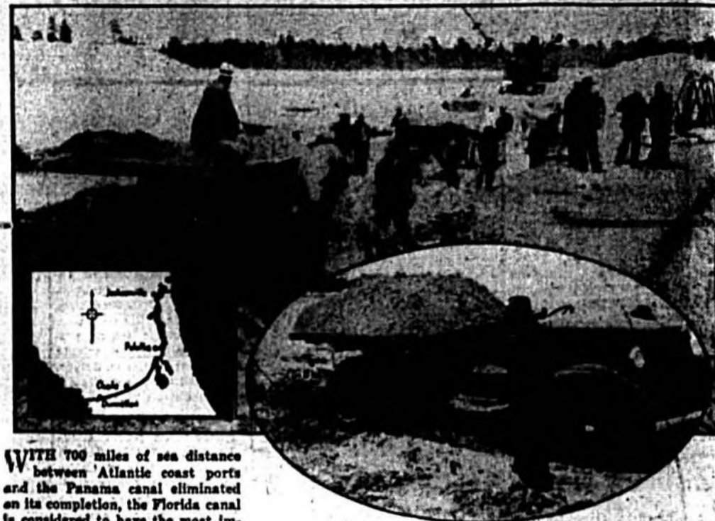
WITH 700 miles of sea distance between Atlantic coast ports and the Panama canal eliminated on its completion, the Florida canal is considered to have the most important military value to the United States of any project that has been launched in recent years. Plans for the canal were worked out by army engineers.