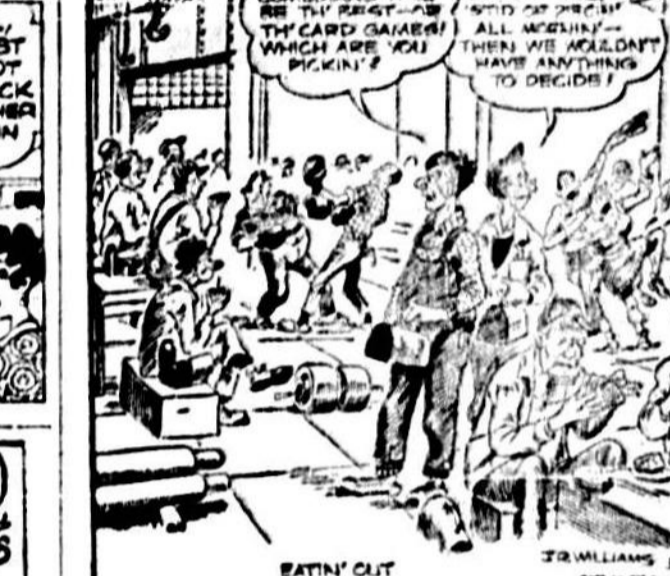
Out Our Way