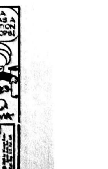
Prickles and Friends