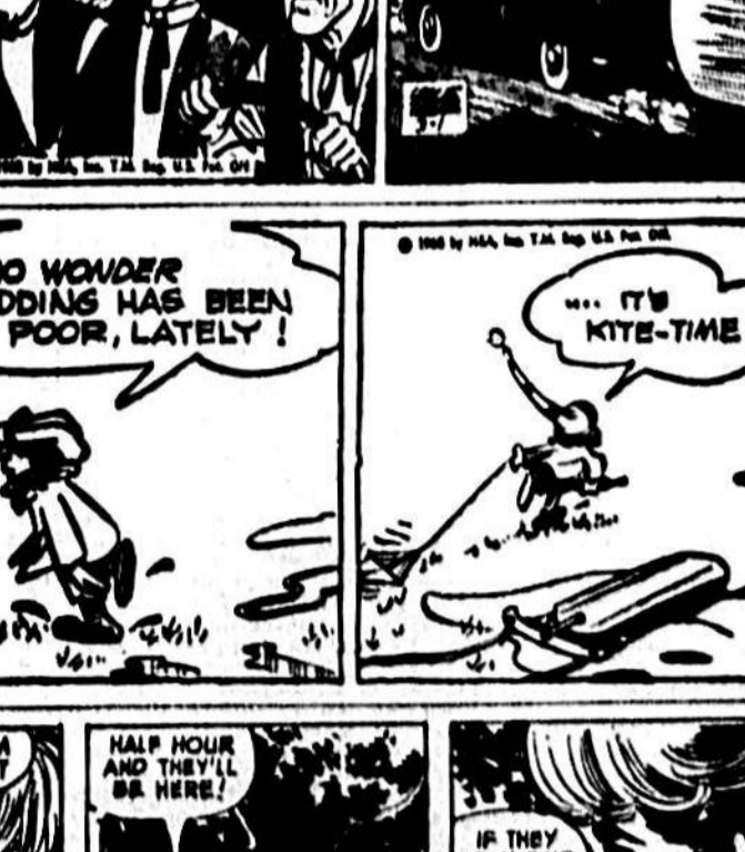
Prickles and Friends