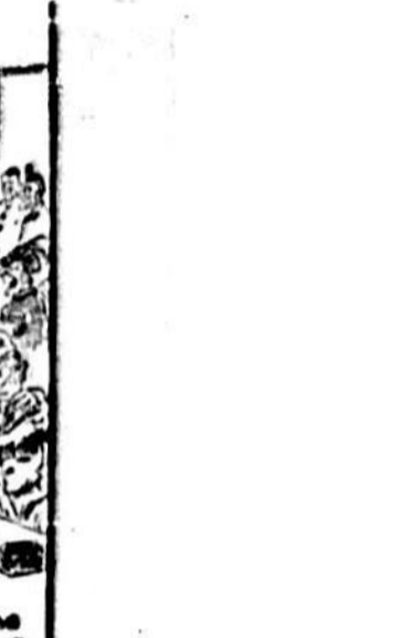
Out Our Way