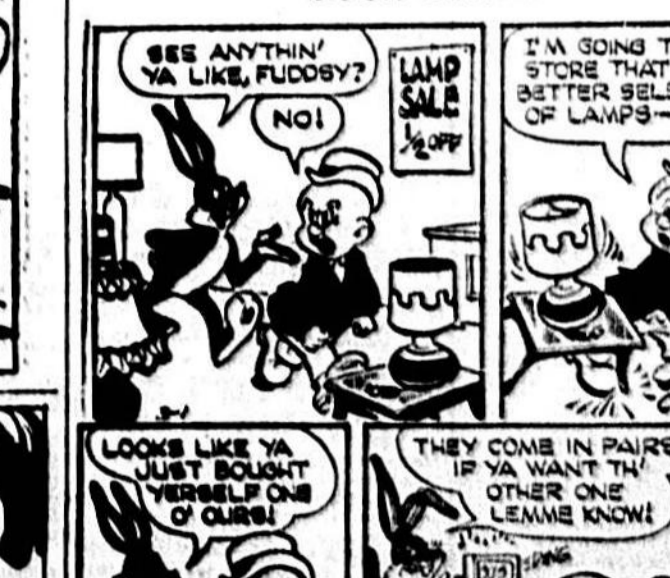
Prickles and Friends