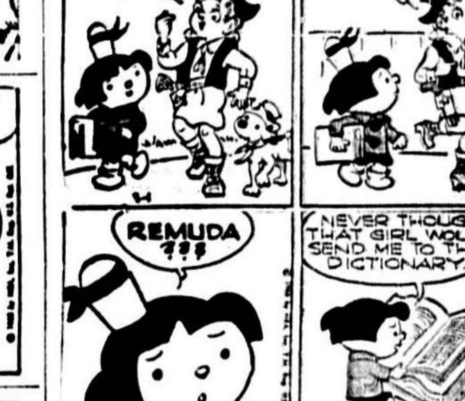
Prickles and Friends