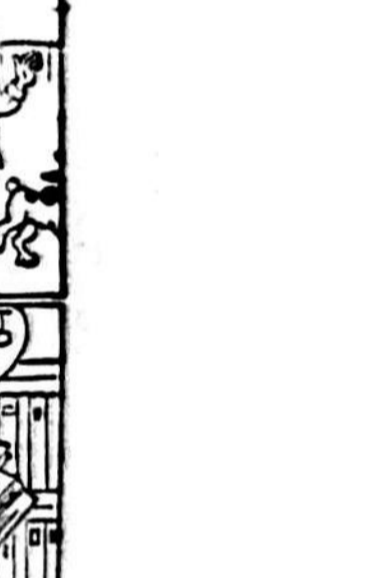
Prickles and Friends