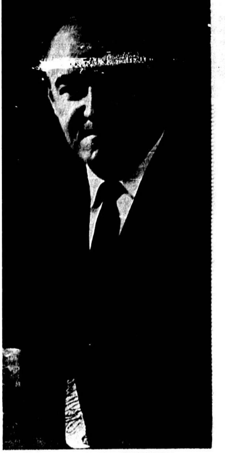
VICE PRESIDENT HUMPHREY