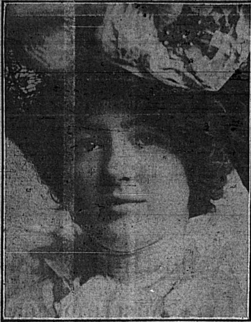
MISS EVALYN WALSH, WHO WILL WED.