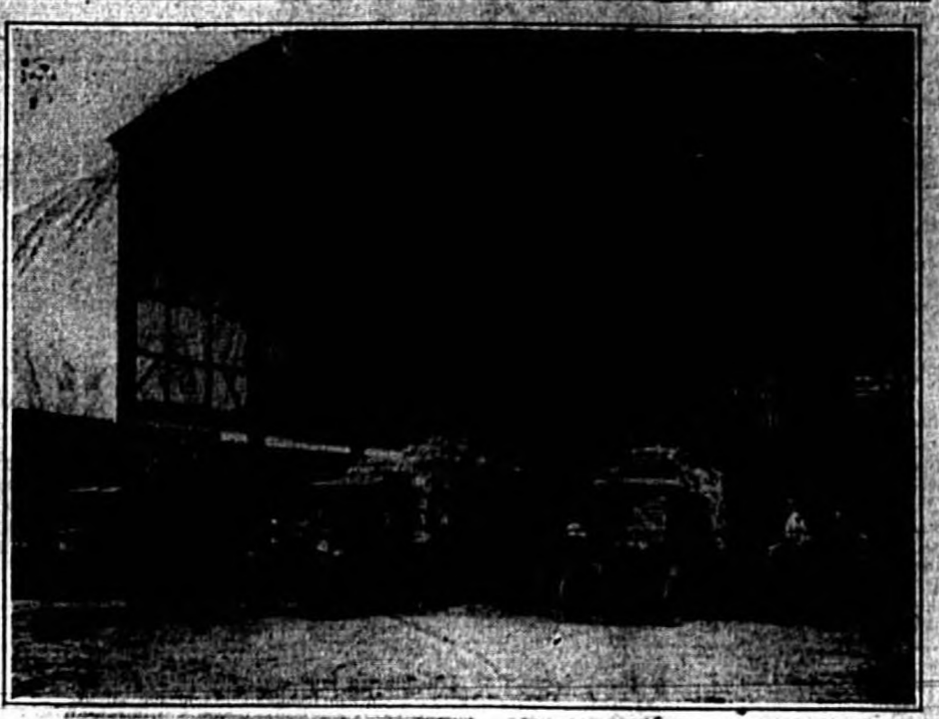
A view of one of Sanford's many pre-cooling plants where celery is washed and pre-cooled before starting its journey to northern markets.