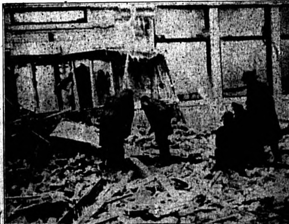
Professional bombers from New York are blamed by Boston police for explosions that damaged four New England theaters in one day. Claiming evidence that the bombers were paid sums that ranged from $250 to $1,000 for each explosion, authorities sought to learn the cause by investigating slights between rival theatrical unions. Theaters were damaged at Lynn, Mass., Pawtucket, R. I., and at Boston where two movie houses were shaken by the blasts. The above is a picture of the Tremont theater in Boston after the explosion.