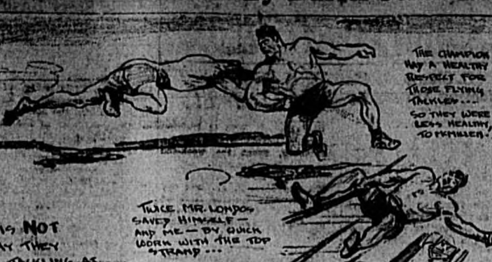
WICE MR. LONDOS SAVED HIMSELF—AND ME—BY QUICK WORK WITH THE TDP STRAP...