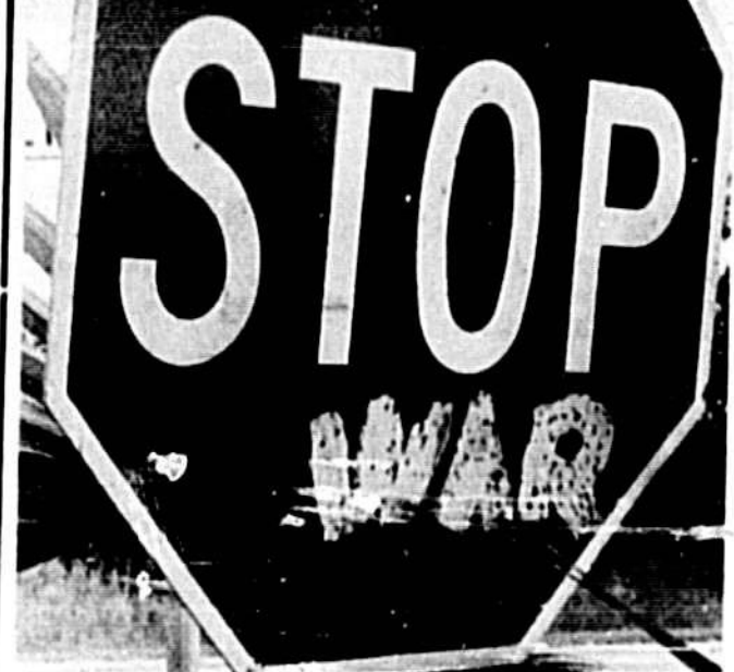
A SIGN ON SR 436: FUTURE FORECAST?

By HELEN THOMAS UPI White House Reporter WASHINGTON (UPI) — President Carter and Israeli Prime Minister Menachem Begin met for two hours today to discuss Israel's secret Mideast peace proposals for ending 30 years of war and tension between Arab and Jew.