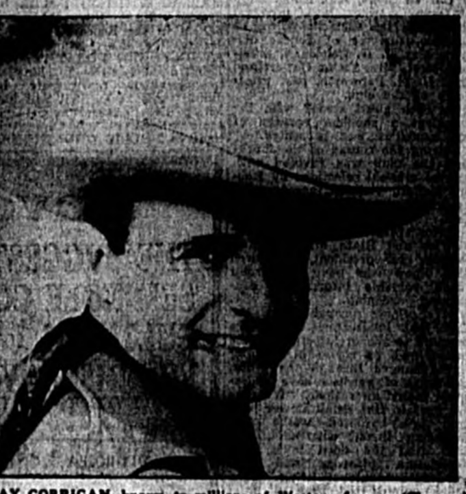
RAY CORRIGAN, keeper to millions of Western fans as "Tomb Raider" of the "Three Musketeers" will be seen in papers with exciting articles on the page of the Ritz Theatre on Friday and Saturday at the Ritz Theatre.