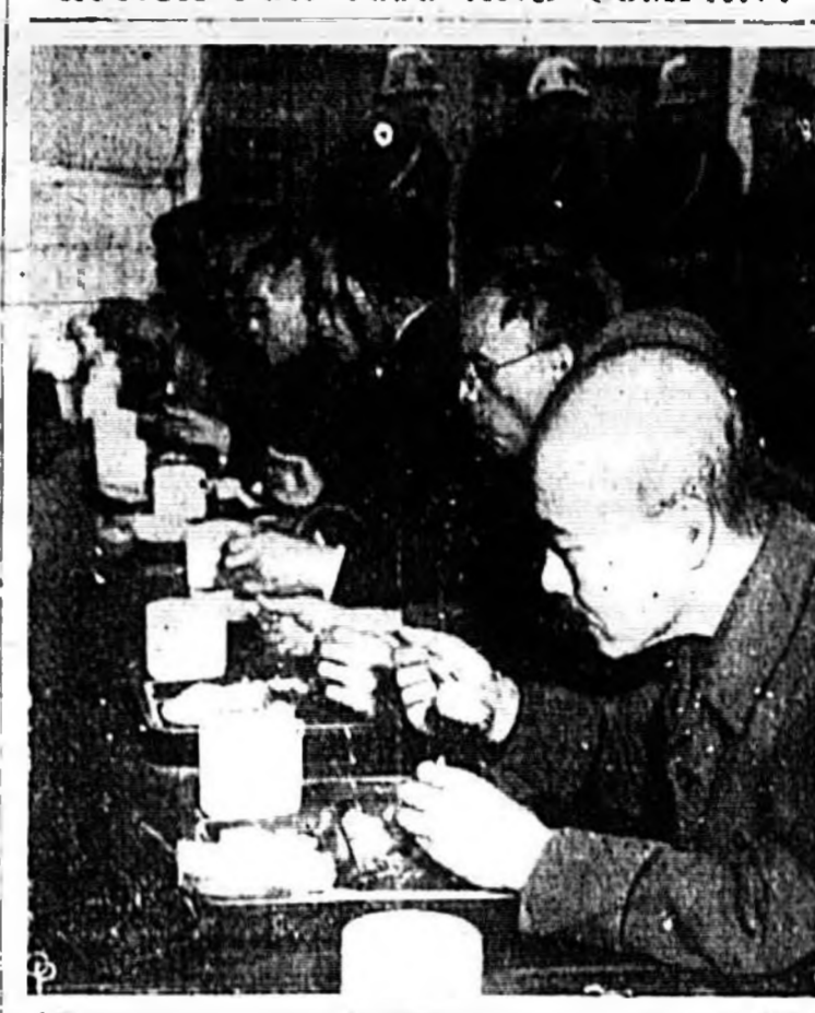
WITH OTHER WAR-CRIMINALS DEFENDANTS seated beside him, former war time Jap Premier Hiroki Tojo (right) is shown eating his lunch in the courtroom building in Tokyo from a regular GI mess tray and without chopsticks. The meal consisted of beef pot pie, mashed potatoes, buttered peas, black coffee and bread and butter.