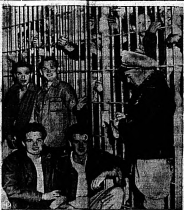
PACKED LIKE SARDINES—and in a jam, some of the 85 rioting high school boys of Santa Monica, Calif., are pictured in the city jail after their arrest on charges of carrying concealed weapons.

A man experienced in business and government can serve you best in your Railroad Commission.