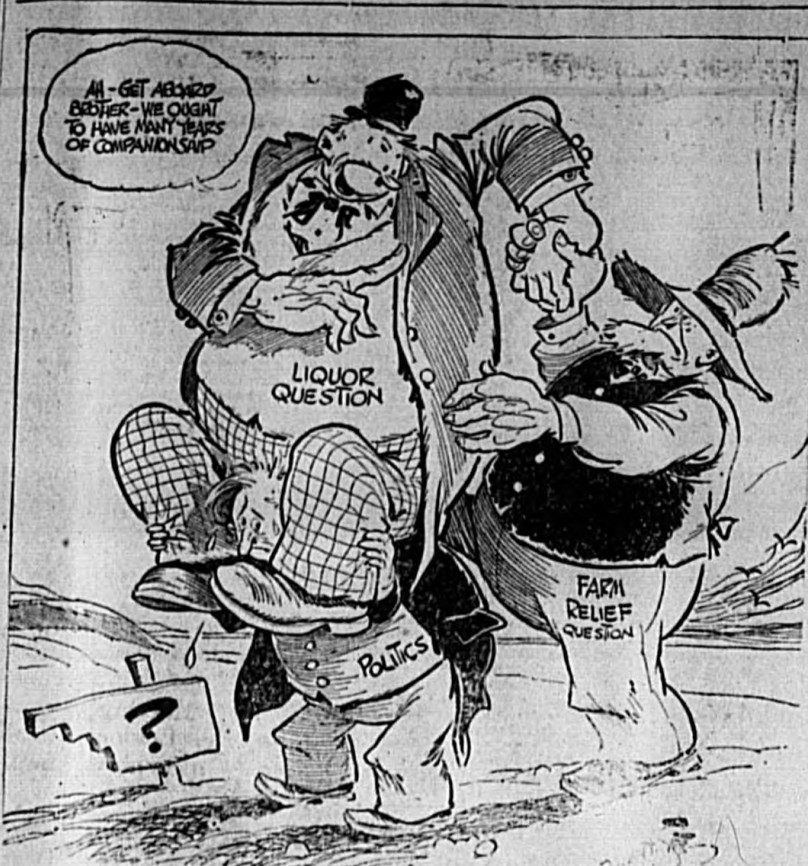
LIQUOR QUESTION. Sinbad has to carry double now. The illustration shows a man struggling under the weight of two large bundles on a pole balanced across his shoulders.