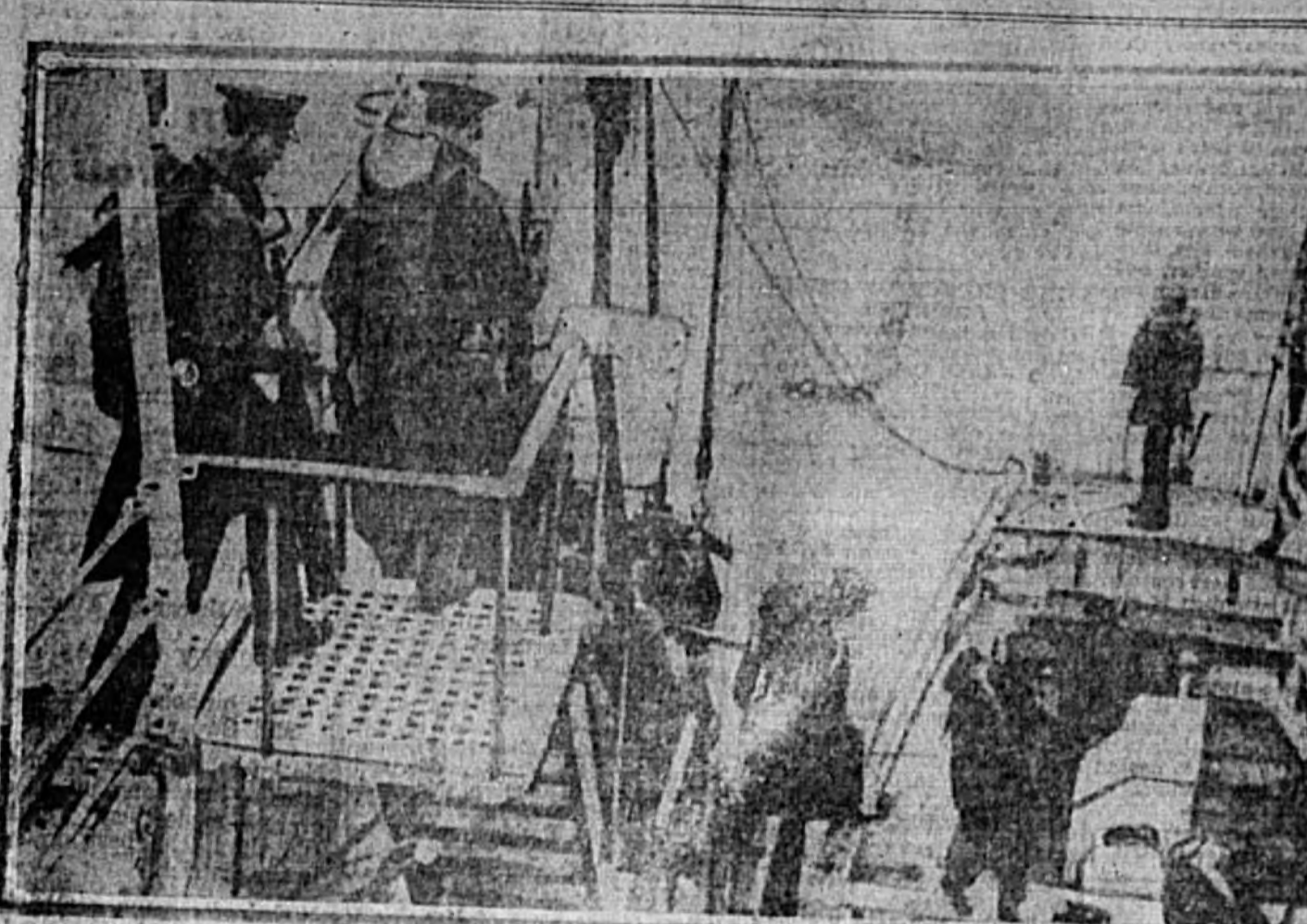
THE FLAG IN CHINA —Here are the first pictures to show armed Americans in China in the present crisis. The picture at the left shows troops leaving the U. S. S. Pittsburgh for the Shanghai front, and at the right is shown the colors just before they were sent ashore to fly over the troops.