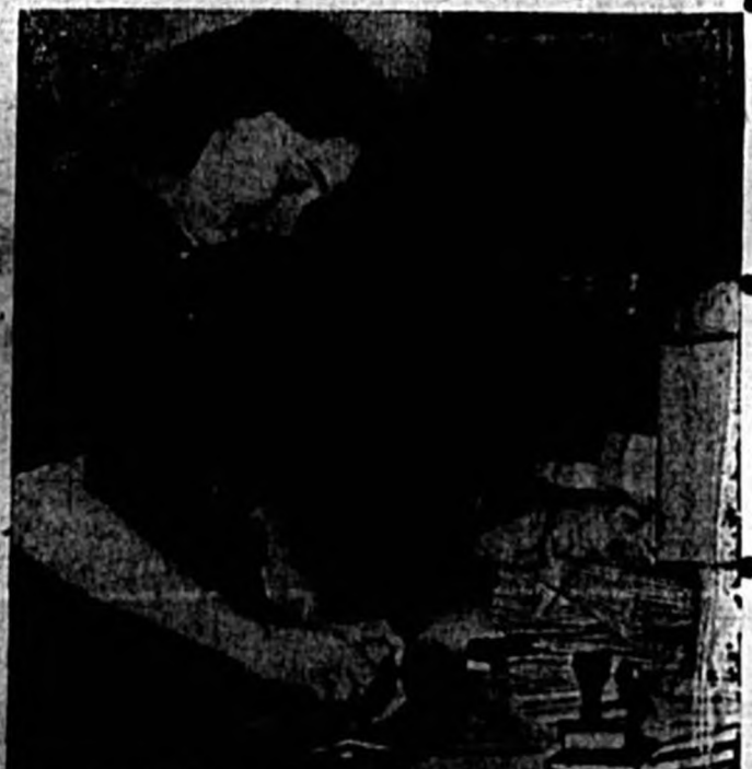
In the throes of its annual postal boom in Christmas, Fla.—a hamlet of 200 people—1,200,000 Christmas greetings pour into the post office to be remailed with the "Christmas" postmark. Postmistress Juanita Tucker handles more of the 90,000 pieces of mail that will leave this Christmas post.