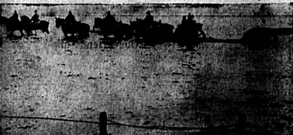
Troop movements in northwestern Germany keep Holland on the alert with her Good Goddess. A battery of Dutch artillery tests effectiveness of purposely inundated areas near the border.