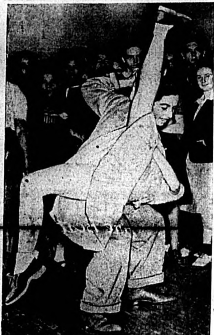
High—very high—jinks such as this prevailed when 10,000 southern California jitterbugs went to town to provide money for the Salvation Army Christmas Basket Fund. Rugcutters cut up so that Los Angeles police on duty had to call for reinforcements.