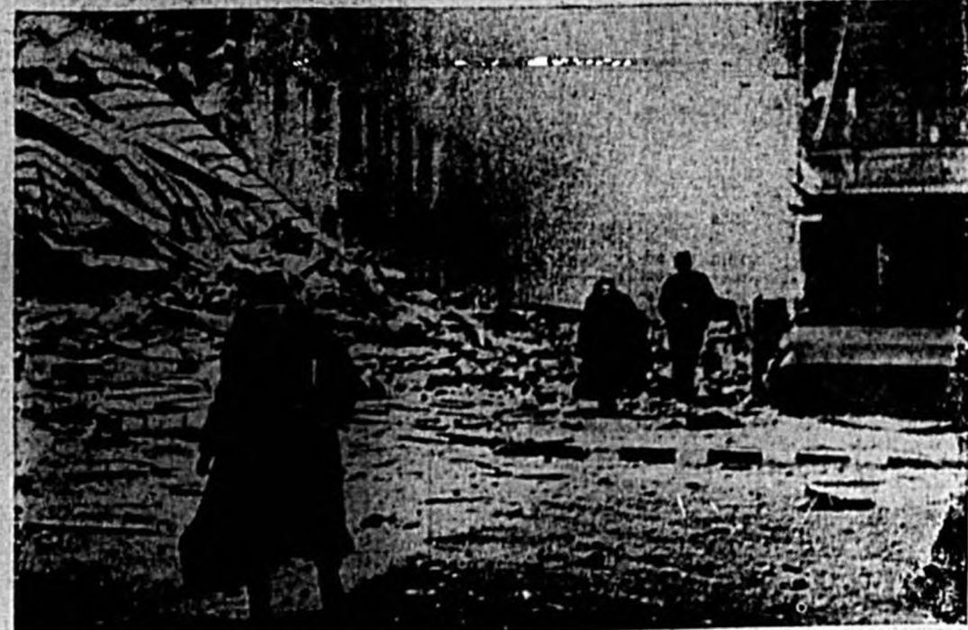
Dazed and driven, a woman of Helsinki, Finland, flees through debris-strewn streets during a Soviet bombing raid on the Finnish capital.