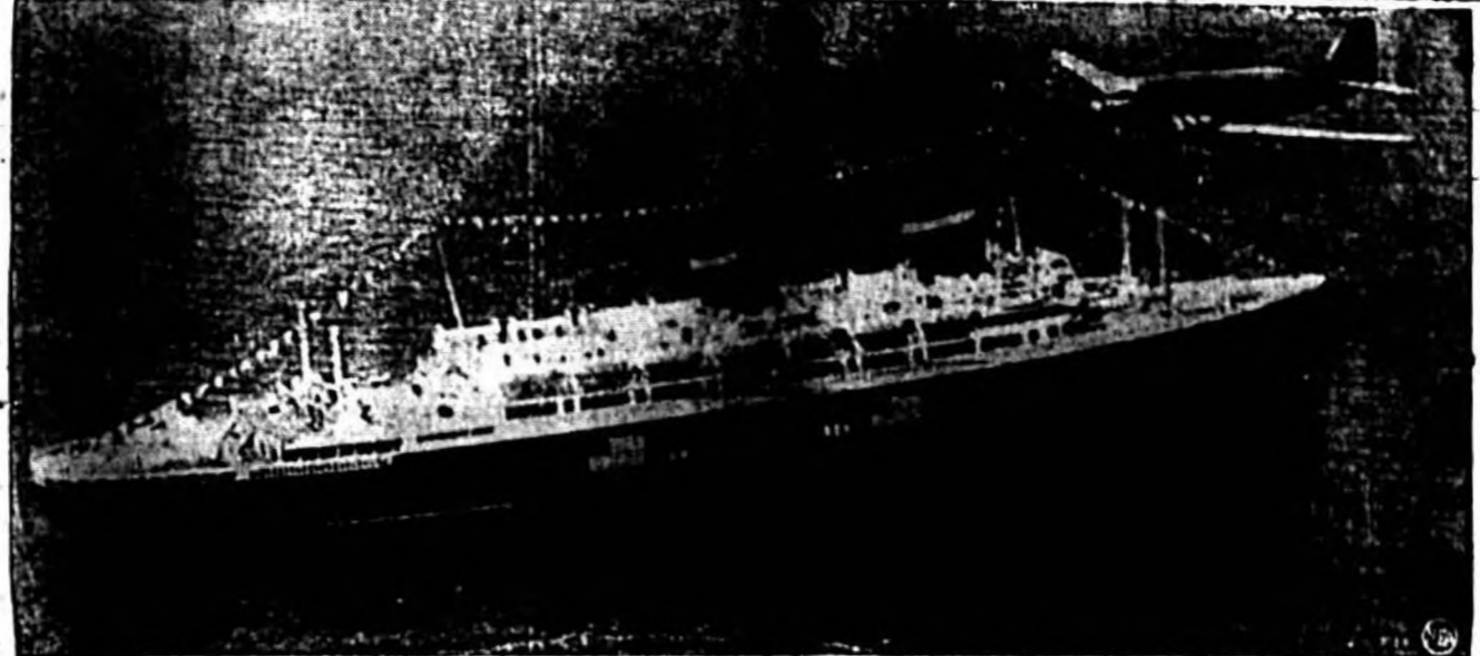
New York gave the huge new United States liner America, queen of the nation's merchant marine, a noisy welcome when she reached her home port after a run from the builders' yards at Newport News, Va. This picture shows a United States transport circling overhead as the America steams up the bay.