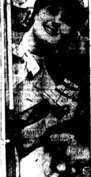
Judge in this comedy British conditions...