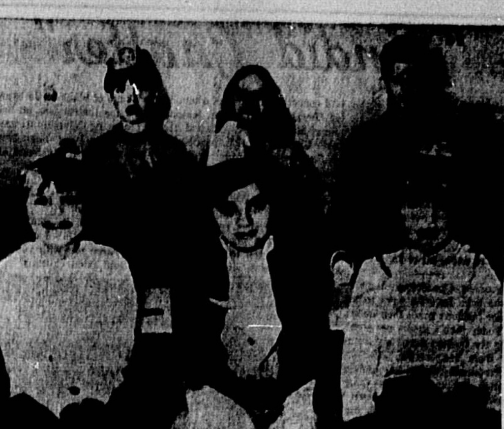
PRIMARY CLASS of Longwood Church of the Nazarene recently enjoyed a "get acquainted" party...