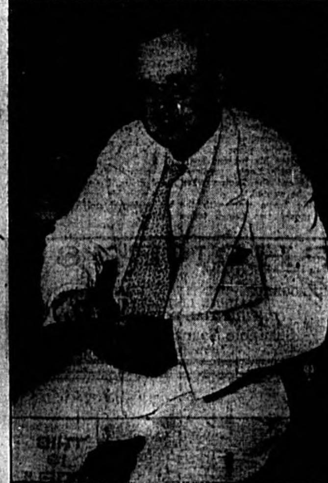
Gov. Alf Landon, the Republican nominee for the presidency, is shown in his office at Topeka, Kans., while the candidate for him gained favor at the convention in Cleveland. A little later he learned of his nomination by unanimous vote.