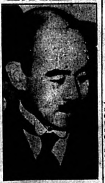
Fumio Goto (above), the strong nationalist leader, was commanded by Emperor Hirohito to form a new government for Japan and serve as acting premier after Premier Okada and two other cabinet members were slain in an uprising of rebellious soldiers.

Reports of hostilities between the forces of the Central (Nanking) government and of South China were received here today. Skirmishes are said to have occurred along the Fukien border.