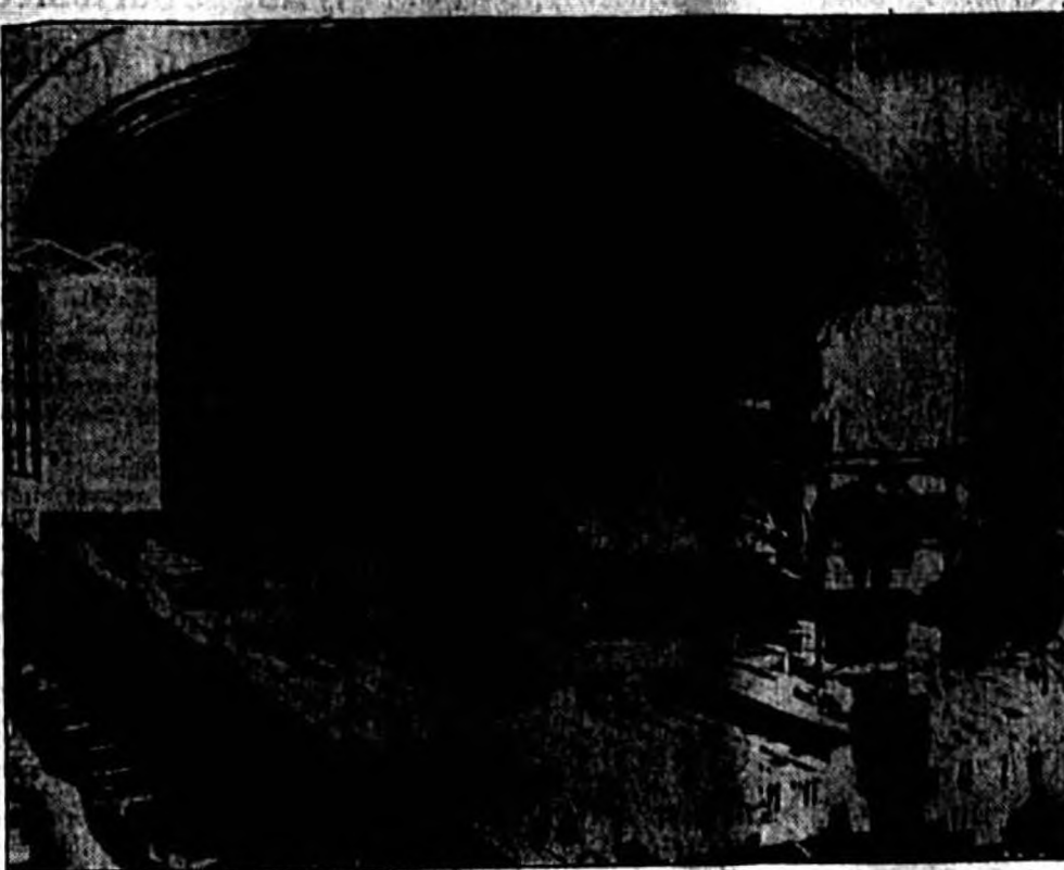
The Republican National convention hall in Cleveland is equipped with a far-reaching "voice" so that anyone who speaks from the main platform will be heard with ease in the remotest corners. Workmen are shown hoisting amplifiers weighing 6,000 pounds to the ceiling. In the foreground is the speakers' platform flanked by press tables to accommodate the army of newspapermen.