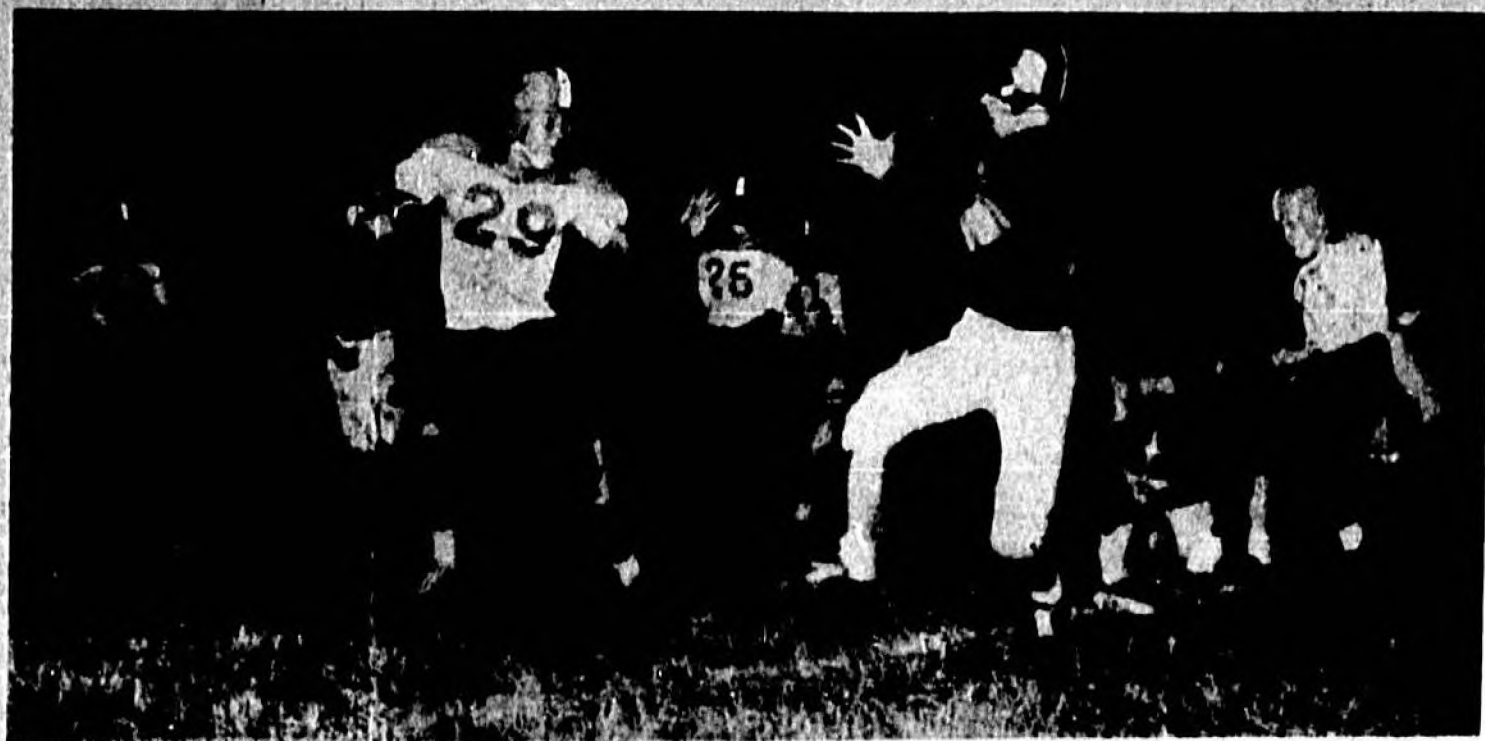
JONES' JAVIN'T —These pictures, taken at the Seminole-Wildcat game in Winter Park's Harper Sheppard Field, Friday night show the ease with which the Seminole High School backs penetrated