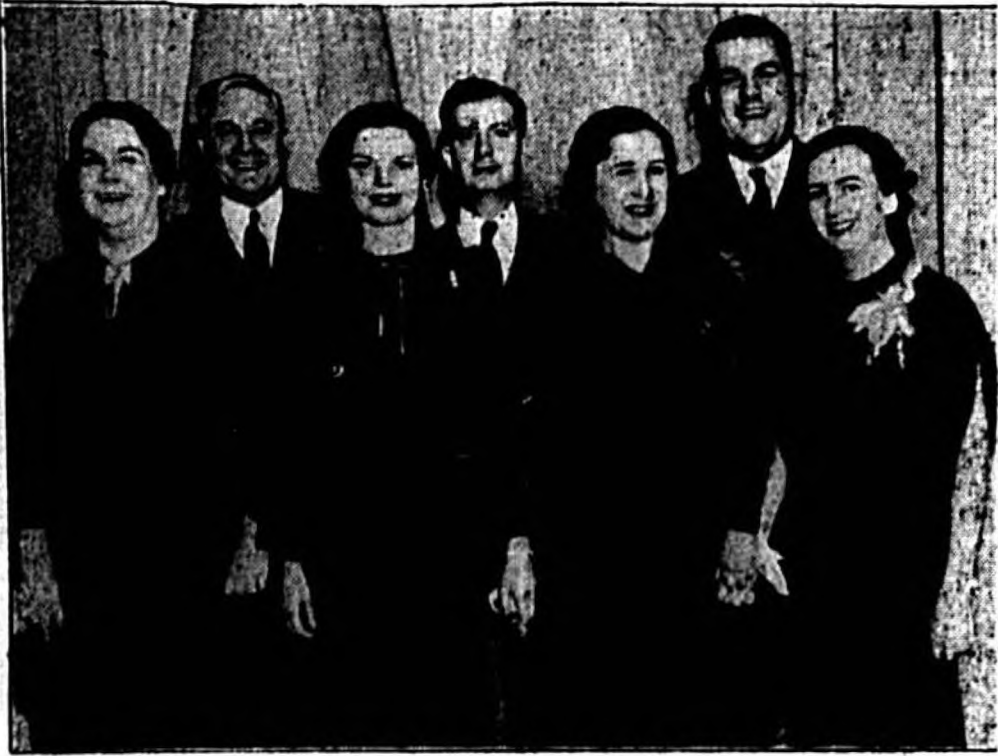
Above is the last newspaper photograph of Governor Oscar K. Allen of Louisiana, who died suddenly yesterday, and members of his official family. The picture was taken shortly after the count of votes in the primary of a week ago. Tuesday showed that Allen had been swept into office as the late Huey Long's successor in the United States Senate. He is shown at the left end of the back row. Next to him is Earl Long, Huey's brother, nominated for governor, and at the right is Governor-Designate Leche. In the front row, left to right, is Mrs. O. K. Allen, wife of the late governor; Mrs. Earle Long, wife of the late Louisiana dictator; and Mrs. Leche, wife of the next governor.