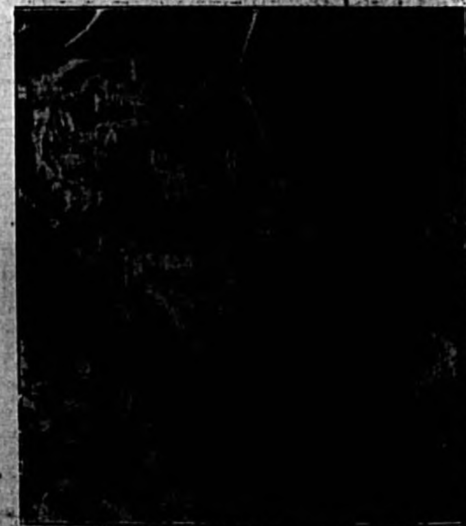
Here is pictured peaceful Windsor Castle, near London, where the body of the late King George V of England was buried yesterday. The body lies in the same vault with the late ruler's father and other British monarchs.