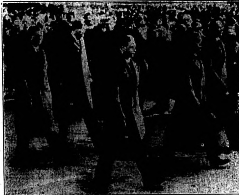
Badly following on foot, the sons of King George V are shown in the funeral procession as the body of Great Britain's monarch was taken from the royal estate at Sandringham to the village railway station for the train trip to London. Left to right in the foreground: The Duke of Kent, the Earl of Marwood, the Duke of York, King Edward VIII, formerly Prince of Wales; and the Duke of Gloucester. The picture was radioed from London to New York.