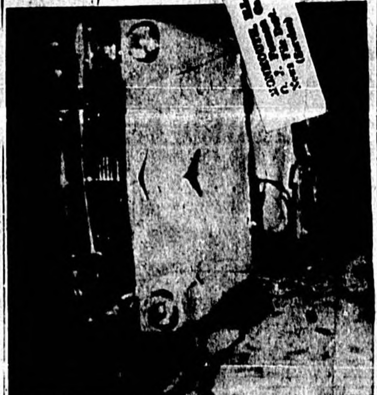
THIS AUTOMOBILE ON ITS SIDE, went up in the air first before skidding to a stop in this position. The three occupants miraculously escaped and were only slightly injured.