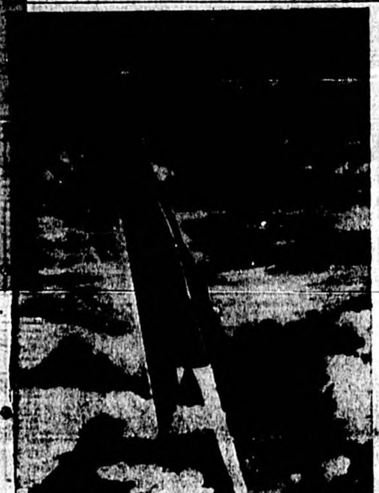
ROCKET-GLIDER WOULD OUTDISTANCE ICBM This artist's concept shows a proposed globe-girdling hypersonic rocket glider capable of outdistancing intercontinental ballistic missiles. The glider, rocket, to be launched via a sled platform (rocket powered) and its own liquid-fuel rockets, is expected to attain a speed of from 15,000 to 20,000 miles-per-hour at an altitude of 200,000 feet. The glider would be designed to enter a ballistic course of descent, guided by small jet rocket blasts.

MIAMI (UP)—A flaming Braniff Airways passenger plane smashed with exploding fury into the swampy Everglades today, killing nine of the 24 persons aboard. Survivors of the 20 served walked away from the broken chunks of the big four-engine DC-7 that had taken off only two minutes before the crash, on route to Rio de Janeiro. The accident occurred shortly after midnight. Just as the cabin lights flashed that passengers could remove their seat belts, a ball of fire shot out from an engine on the right side, plummeted to earth. Braniff officials said the nine dead included an official of the airline from Dallas, three pilots and a pilot's wife, all flying as passengers. The five crew members operating the plane escaped death. Airline officials said that at least five of the dead were burned. Nine Bodies Recovered Three Coast Guard helicopter teams began lifting the injured and dead from the scene nine minutes after the crash was reported. The crews confirmed that nine bodies had been taken from the wreckage. Witnesses reported a tremendous explosion rocked the big