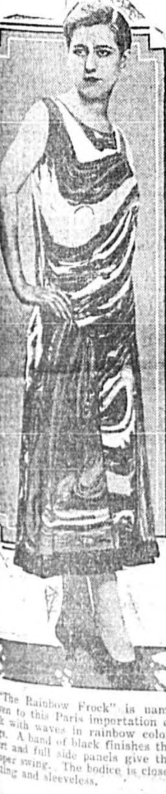
"The Rainbow Froek" is name given to this Paris importation of dress with waves in rainbow colors. A band of black finishes the upper and full side panels give the proper swing. The bodice is close-fitting and sleeveless.