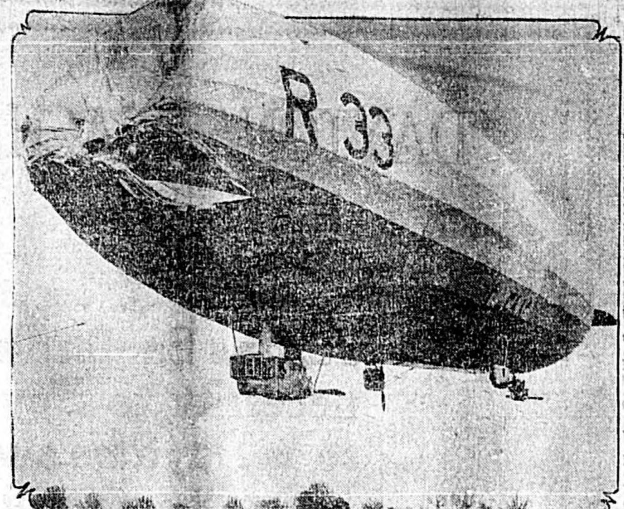
Twenty-nine hours after it was torn from its moorings, the R-33 returned to Pulham in Norfolk, England, after having been blown out over the North Sea. The nose of the craft was torn when the high gale snatched her away from her moorings.