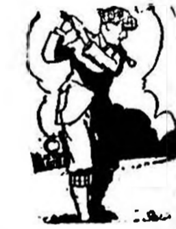
Golf on one of the best courses in all Florida.

We advise both the homeseeker and the conservative investor to investigate the multitude of advantages to be found at Loch Arbor.