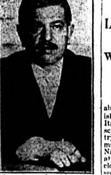
The fall of Premier Laval of France was believed almost certain yesterday to result from his agreement with Sir Samuel Hoare of Great Britain on the discarded peace plan, an agreement which forced Hoare's resignation as British foreign secretary. Today's dispatches, however, state that Laval will remain at the head of the French government.

Envoys Endeavoring To Obtain Promise Of Aid In Case Of Armed Hostilities