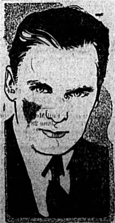
THOMAS MEIGHAN IN CIVILIAN CLOTHES A PARAMOUNT PICTURE

JACKSONVILLE, Oct. 27.—Definite announcement was made here today that Jacksonville will entertain Governor Hardee and Admiral Williams S. Sims, together with their wives, at the celebration on Monday, November 12, of Armistice day.