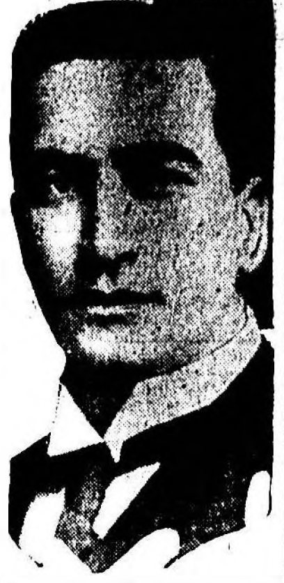
Senator Albert Cummins, For 39 Years Leader In Iowa Politics, Passes Suddenly After Suffering Relapse