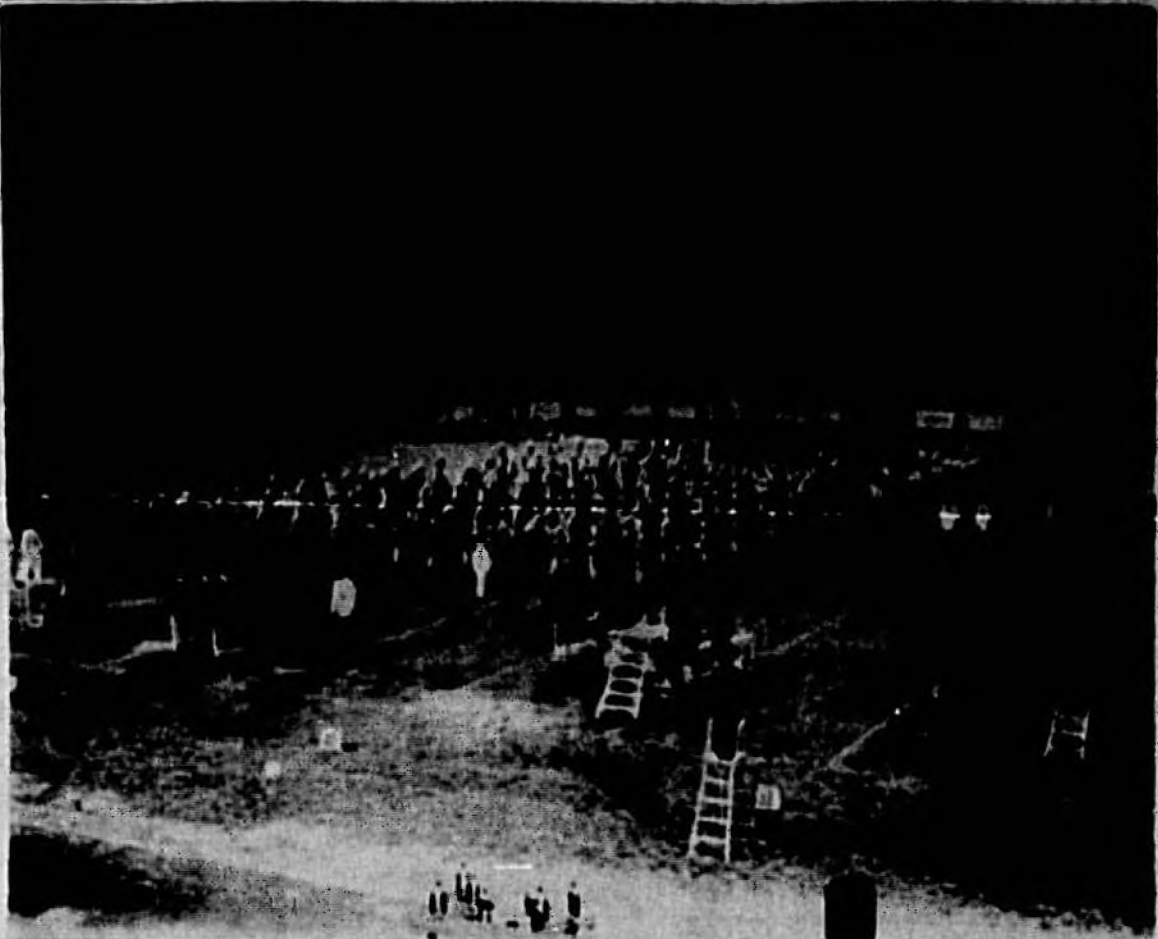
Rows and rows of the finest virtuos

Seventy six trombones and many more instruments were on the field Friday night at Oviedo High School for the annual Seminole County High School Band Festival.