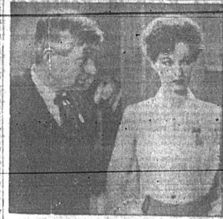
In a scene from "The Corny Chairman" playing tonight and Tuesday at the Milane.