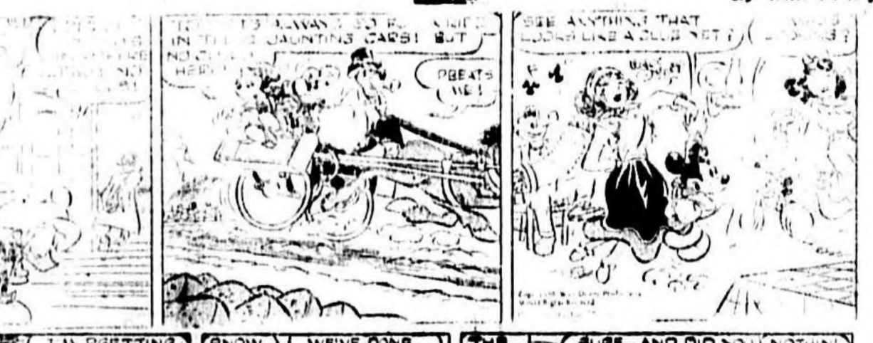
THE BLARNEY STONE