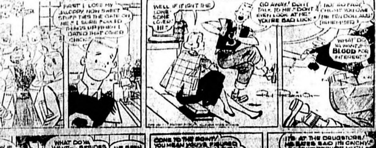
IT'S AT THE DOUGHNUT SHOP...